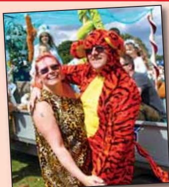
Dancing to the Samba rhythm

Saturday 14th June saw another successful Carnival day which was blessed with sunshine, despite the threat of heavy showers. The crowds attending the event were treated to a host of sideshows and entertainment, which included gym and dance displays and two impressive demonstrations of birds of prey. Sadly, the second demonstration was missing Jordan the Peregrine Falcon, who soared so