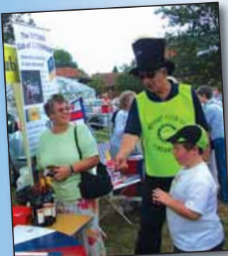
A youngster tries his hand at the Caterham Rotary Club's 'Spin the Wheel'