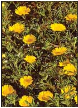
The Astericus will provide colour throughout summer in a dry, sunny plot.

The type of soil is important. Acid soils found in areas of high rainfall or under tall conifers where their needles fall are essential for camellias,