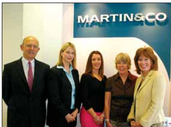
The team at Martin & Co

The Caterham franchise of Martin & Co offers a full range of property management and letting services tailored to meet the specific needs of clients. If you would like to see how Martin & Co (Caterham) could help you let out a property, give them a call on 01883 332933 and benefit from their summer offers.