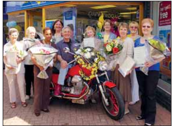
Marie Curie volunteers with Eric Richard and one of his many motorcycles

Eric Richard, who plays the much loved Sgt Bob Cryer in 'The Bill', rode into town last month to present long-service awards to volunteers at the Marie Curie shop in Church Walk, Caterham Valley.