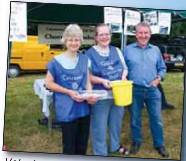
Volunteers on the Caterham Overseas Aid Trust (C.O.A.T.) chocolate tombola