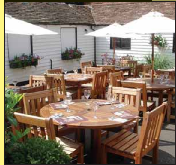
The White Hart, Godstone