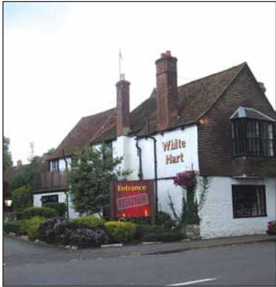
We have a £100 meal voucher for the White Hart Inn in Godstone to give away to one lucky winner!