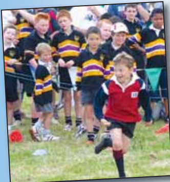
The Old Cats rugby juniors and seniors put on a display for the crowd