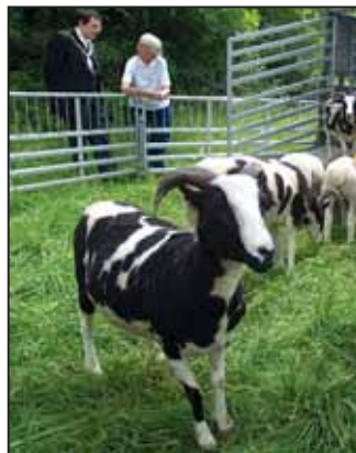
Sheep play a vital role in protecting rare chalk-loving plants at Happy Valley

Valley to see some of the sheep provided by the Old Surrey Downs Project. Dominic North, Happy Valley Site Manager, explained how the sheep have the important task of keeping the chalk grassland short enough to allow orchids and other chalk-loving wild flowers to flourish. The new Downlands Circular Walk board displays long and short versions of the walk, with some information about the wildlife and history of the area. A new version of the Circular Walk leaflet is now available from the Downlands Project on 01737 737700.