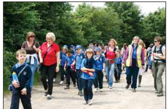
Stepping out - the children from Warlingham Park School raising funds for a children's choir in Africa

The children from Warlingham Park School in Chelsham took part in a sponsored walk last month to raise money for the 'Pearl of Africa Children's Choir', a charity that builds homes and schools for orphaned and destitute children in Uganda. The whole school took part in the walk from Chelsham Common to The White Bear in Fickleshole and back again covering a distance of four miles.