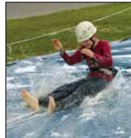
Having a great time on the bungee slide