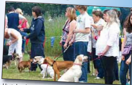
Hundreds of people flocked to the League of Friends of Dene Hospital Summer Fête last Sunday, raising thousands of pounds for the charity. The Fête is the League's main fundraiser but sadly had to be cancelled last year due to wet weather. Fortunately, all went ahead as planned this year, thanks to good weather and plenty of local support.