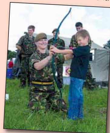
A budding Robin Hood gets to grips with archery