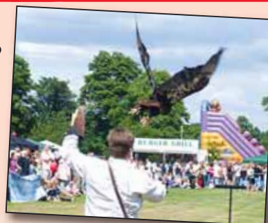
At least the eagle returned to his trainer!

high during the first demonstration, he lost his bearings and failed to return. The crowd were reassured that he would eventually be recovered, thanks to a tracking device attached to his leg. Last year's event raised £6,000 for local organisations and the Carnival Committee is confident the figure will be even higher this year, when it is announced at the AGM in September.