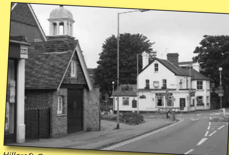
Hillcroft Corner today