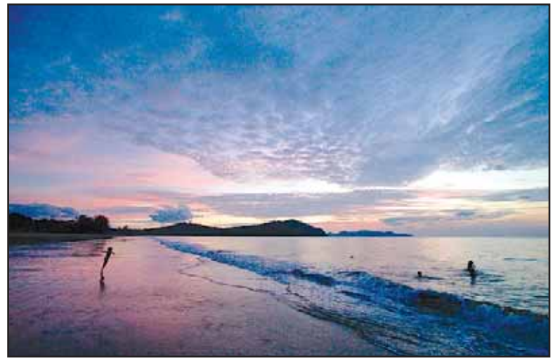
Sunset

For more information visit www.andamandiscoveries.com or e-mail: info@andamandiscoveries.com