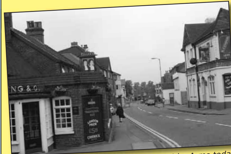
Ye Olde King & Queen and the Blacksmiths Arms today - note how both of the old entrances are now blocked up