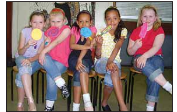
The Pine Class Dance Troupe