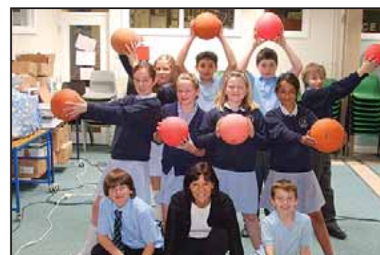
Learning to dance with props