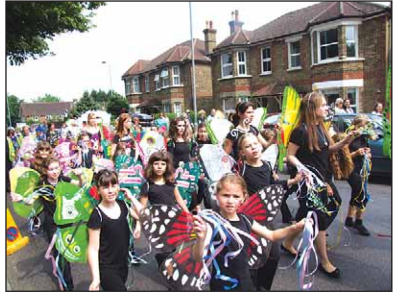
Last year's colourful Carnival parade

We're counting down to the 2008 Caterham Carnival which is taking place on Saturday 14th June on Westway Common, Caterham-on-the-Hill. This year's beneficiaries are the 1st Woldingham Guides and 9th Caterham Guides; the Caterham District Explorer Scouts; Marden Lodge School and Kestrels Children's Centre. The Carnival opens at 1.00pm