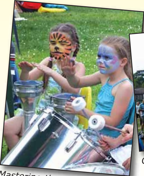
Mastering the African Drums