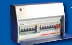
WYLEX SPLITLOAD BOARD FULLY LOADED £59.95