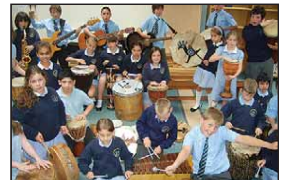
Having fun with African Drums