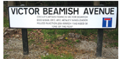
Victor Beamish Avenue: