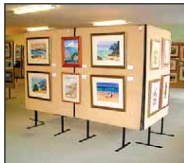
The Woodhouse Centre became a stylish art gallery for the exhibition