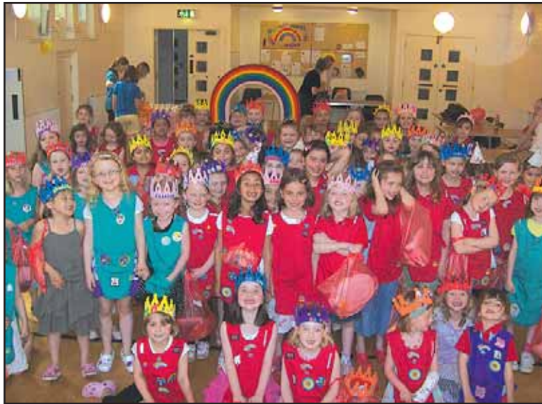
Party time for the Caterham and Tilburstow Rainbows