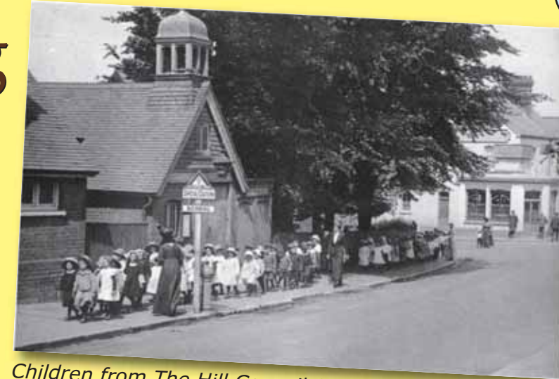
Children from The Hill Council School parade to Queen's Park for Empire Day celebrations in 1914*

The High Street and what is now called The Raglan Precinct areas are now home to 'specialist shops' which bring in regular visitors from outside Caterham. As well as the traditional butchers and greengrocers that still trade on the Hill, you will find outlets like Vivace Pianos, Jam music store and the soon-to-open Barretts of Caterham, suppliers of guns and other sporting goods. Alice Rose Gifts has saved many a trip to Croydon for a last minute birthday present, and Milan Design is worth a visit if you want something stylish for a special occasion. Add to the list four friendly public houses, two restaurants and two cafes, you have all the ingredients for a memorable visit.