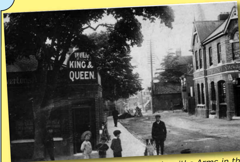
Ye Olde King & Queen and the Blacksmiths Arms in the High Street taken in 1910*

26 Chaldon Rd, Caterham-on-the-Hill Tel: 01883 348814