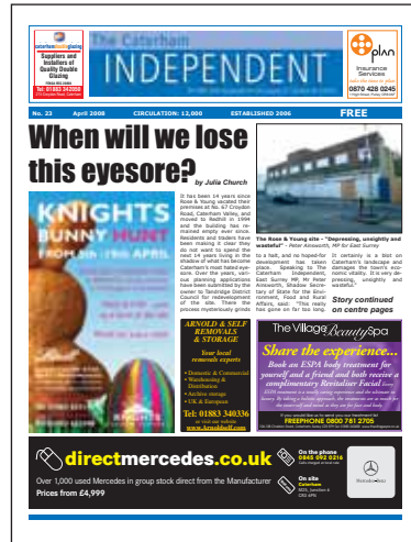
The front page of the April edition of The Caterham Independent

The spokesperson explained that Caterham Properties is not the sole owner of the land. Last year a portion of the land was sold to another company who have since sold part of their acquisition. Both companies have agreed that the best way forward is to work with Caterham Properties Ltd to create a joint development submission to the Council for planning approval on the basis of one building only, with a common street facade. Caterham Properties Ltd are in the process of working with other professionals to progress the planning application and design of the new development. They have stated that they want to provide a good looking building and will not cut costs in doing