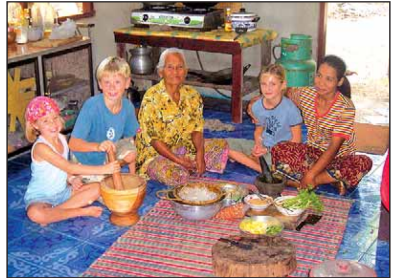
Dining with locals on a family holiday