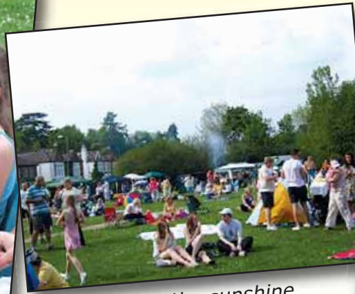
Crowds enjoy the sunshine