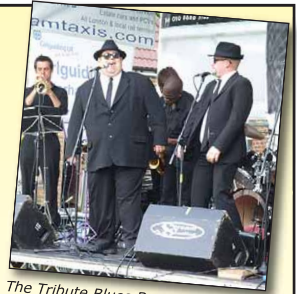
The Tribute Blues Brothers