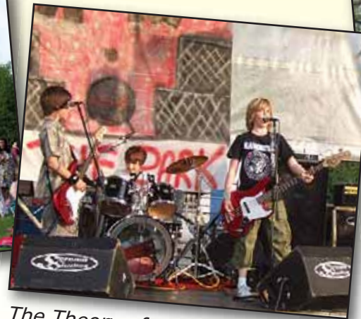
The Theory of 6 Degrees