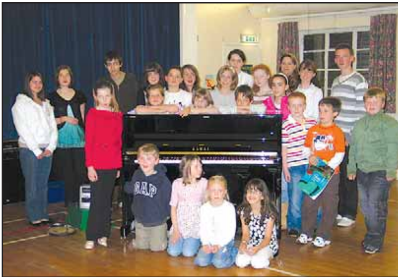
Star performers - the pupils of Vivace Pianos

They say "practice makes perfect" and it certainly did for the pupils of Vivace Pianos who gave some excellent performances last month at the Caterham Hill Community Centre. Children of all ages and standards took part as well as teenagers and even some brave adults! The concert was held to show off all the dedicated piano practice of the last year to families, friends and each other. It cer-