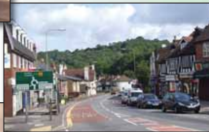
The same view of Whyteleafe taken in 2009 has changed very little over the last 70 years.

In the last 150 years Whyteleafe has developed from largely unpopulated countryside between the parishes of Warlingham, Caterham Valley and Coulsdon, to a village in its own right. Following the advent of the railway in the 19th Century, Whyteleafe started to attract those seeking a healthy and attractive place to live that was not too far from London.