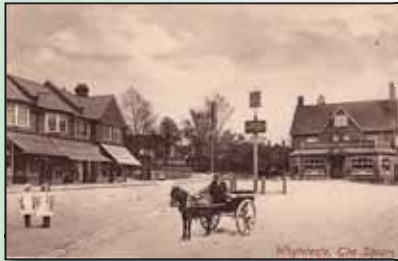
In 1865 the White Leaf Tavern was opened, facing The Square. As with Caterham Town Centre, with the advent of the motor car The Square has since become a large roundabout!