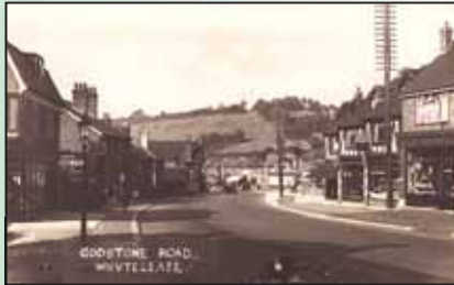
The main thoroughfare through the centre of Whyteleafe, now known as the A22, was constructed from Purley southwards in 1796. Above - Whyteleafe in the 1930's.

In the last 150 years Whyteleafe has developed from largely unpopulated countryside between the parishes of Warlingham, Caterham Valley and Coulsdon, to a village in its own right. Following the advent of the railway in the 19th Century, Whyteleafe started to attract those seeking a healthy and attractive place to live that was not too far from London.