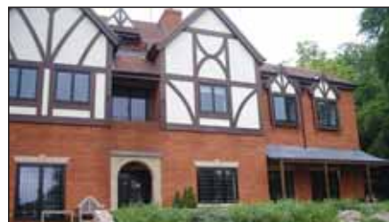
WESTERHAM £1900 pcm

A prestigious 3 double bedroom apartment with balcony, secure underground parking and use of communal grounds.