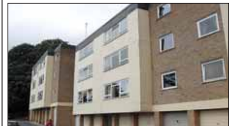
WARLINGHAM £795 pcm

A 2 double bedroom flat with garage, parking and far reaching views, convenient for stations at Upper Warlingham and Whyteleafe.