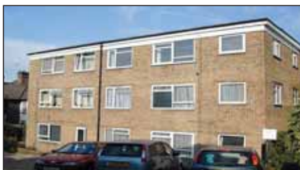
REDHILL £595 pcm

A completely modernised spacious 1 bedroom second (top) floor flat close to Redhill town centre and station with parking area.