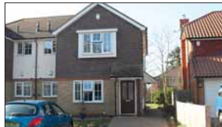
CATERHAM ON THE HILL £750 pcm

A very well presented, 2 bedroom modern first floor maisonette in this quiet, development off Essendene Road with shared garden and allocated parking.