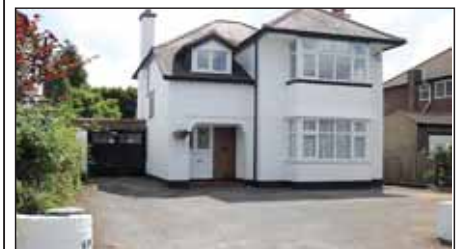
CATERHAM £1450 pcm

Just refurbished - A 4 bedroom detached house with garage, off street parking for 4 cars, new carpets and brand new conservatory.