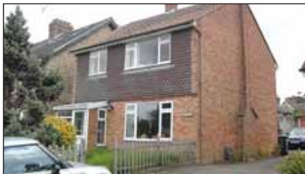
GODSTONE £1350 pcm

A modern 3 bedroom detached house, recently refurbished, convenient for Godstone village and with easy access to M25 motorway.