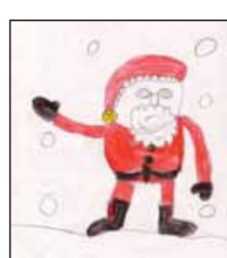
Miles Fisher, age 9