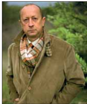
The iconic Maremmana Jacket in Duca Visconti di Modrone stretch corduroy.

"The women's KVJ range in particular is brilliant," commented Bob. The waterproof and wind-proof hunting jacket has a fleece lined high collar with leather inserts, two roomy cargo pockets, handwarmer pockets with fleece, rear gamleather shooting pad, preformed elbows and adjustable cuffs as some of its features.