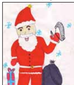
Camellia Kelly, age 10