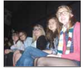
Members of Woldingham Guides Senior Section at the concert last month.

Four Guide Companies and Woldingham Senior Section from Caterham travelled to Wembley Arena last month for the 'Big Gig', a pop concert just for Girlguiding. Eleven thousand screaming girls (and one or two Guiders) had a brilliant time singing and dancing to Pixie Lott, JLS, Scouting for Girls, the Noisettes and the Saturdays to name but a few. The whole arena shook at times and I think even the artists were surprised by the enthusiasm of the audience. Guides from as far away as Glasgow and the Isle of Man had travelled to Wembley for the event, so those of us from Caterham didn't really feel we could complain about our journeys. A great evening was had by all, and I am sure that the ringing in my ears will stop very soon. This year, 7th Caterham (St John's) Guides are raising