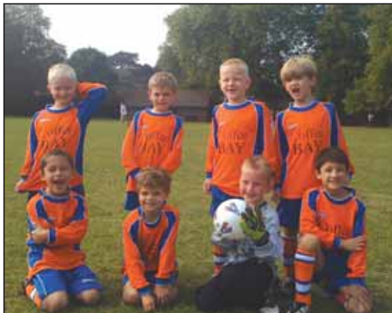
Caterham Pumas Under 7's.

Caterham Pumas Football Club would like to thank the Caterham Carnival Committee for the cheque of £2,500.00 which we received as beneficiaries of the Caterham Carnival. The money will go towards replacing our clubhouse. We would also like to thank all those people who were involved in what was another great day. This came at the end of one of our most successful seasons which had one of our teams as league champions and three teams reaching their respective league cup finals. We run teams from under 7's to under 17's with one