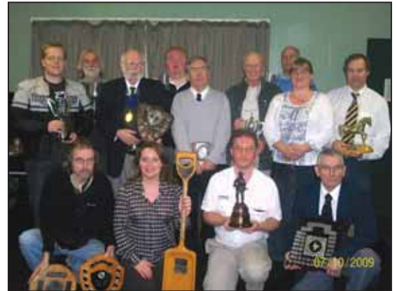
Members of the Caterham & District Rifle Club with their trophies