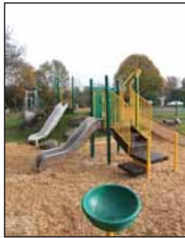
The new playground in Mint Walk, Warlingham.

Bletchingley Playground Friends raised just over £35,000 towards the Grange Meadow project, while £50,000 was provided by the Playbuilder scheme. Bletchingley Playground Friends, a group of local parents and individuals, raised the money by organising sponsored swims and fetes, as well as attracting £8,500 from the Rural Ac-