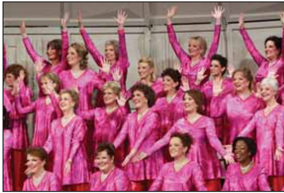
'Surrey Harmony' dazzling the audience in Nashville

On Thursday 22nd October, in front of a cheering audience of 10,000 at the Sommet Centre in downtown Nashville, they wowed the judges with their performance of 'I Never Meant to Fall in Love' and 'Dixieland One-Step'. On the Saturday night they entered the