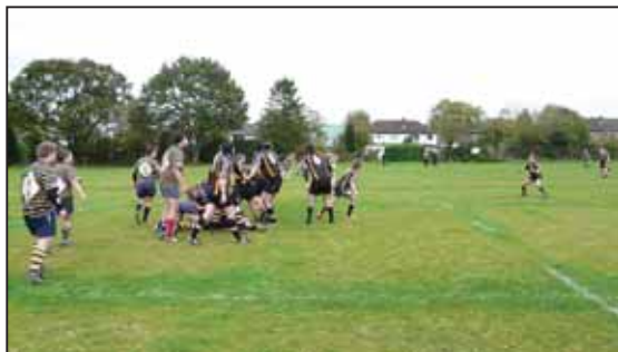
Old Cats passing the ball during their match against Old Cranleighs last month.

Old Caterhamians hosted Old Cranleighs on Saturday 17th October for their third league game of the season. The afternoon started with a pre-game lunch which raised £150 for the Help for Heroes charity which the club fully supports.