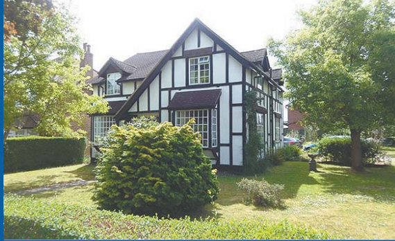
Caterham on the Hill - £539,950 EXTENSIVE REAR GARDENS

A large five double bedroom detached family home located in a sought after residential road on a large plot. The house has accommodation appointed over three floors and has a large rear garden.