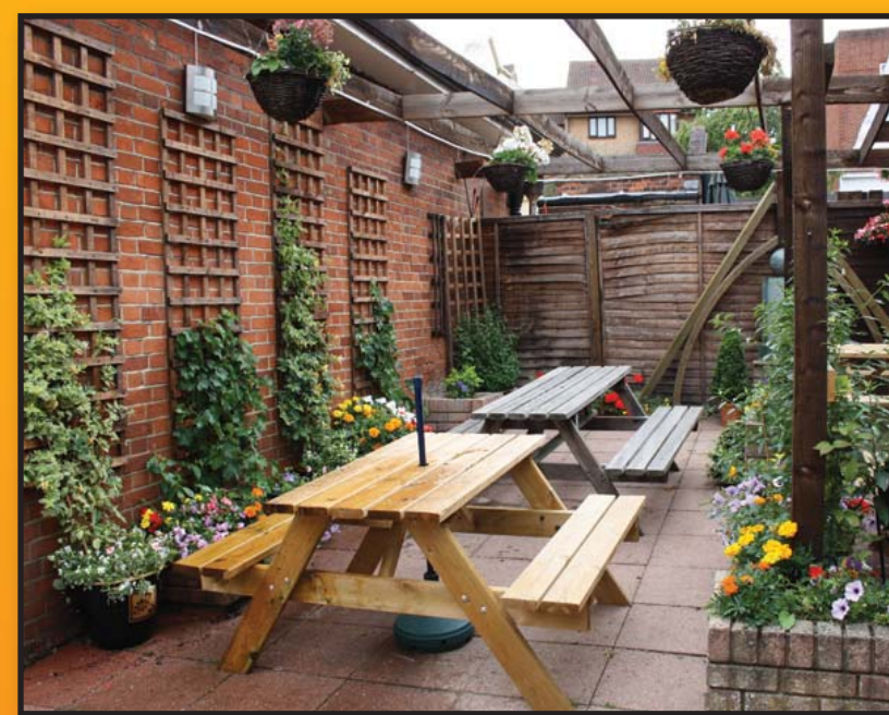
The garden of the Whyteleafe Tavern where meetings of the Whyteleafe Business Association are held in the function room.