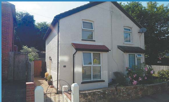
Caterham on the Hill - £229,950 PRESENTED IN EXCELLENT CONDITION

A well presented and larger than average three bedroom maisonette with accommodation arranged over two floors. The property is conveniently located within a mile of Caterham Town Centre and Railway Station.