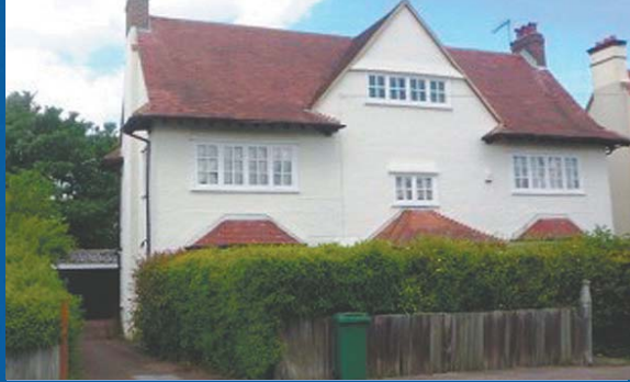
Caterham on the Hill - £595,000 NO ONWARD CHAIN

Old Coulsdon 01737 551188 ▪ Caterham on the Hill 01883 348035 ▪ Lettings 01883 343355