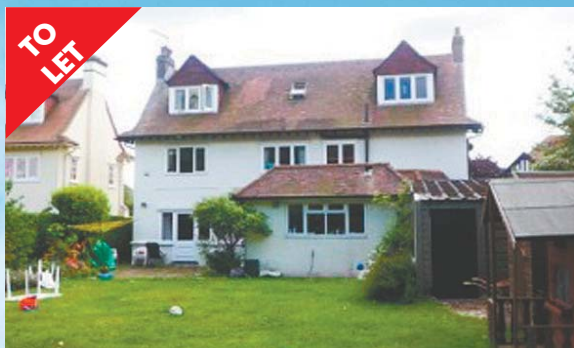
Caterham on the Hill - £1,800 pcm REAR GARDENS IN EXCESS OF 100'

A two bedroom detached bungalow located within a cul-de-sac and popular residential area in Caterham on the Hill. No onward chain.