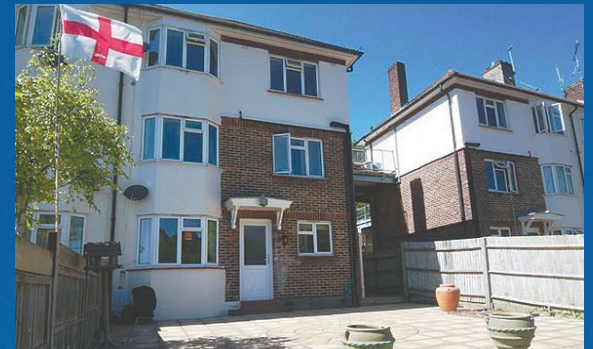
Caterham Valley - £179,950 REFURBISHED AND PRESENTED IN GOOD CONDITION

An immaculately presented four bedroom detached house located in a popular cul-de-sac in semi rural chaldon. The property has the potential for extension subject to the usual planning consents.