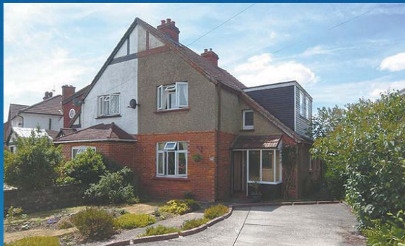
Caterham on the Hill - £285,000 IN NEED OF SOME MODERNISATION

A three bedroomed mid terrace house ideally located within a quarter of a mile of Caterham Town Centre. The property has a modern kitchen and bathroom and a garage.