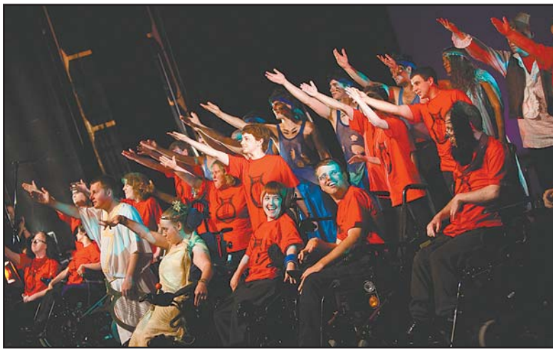
The cast of 'Orpheus the Mythical'

throughout. Credit too must go to the writer Richard Stilgoe himself. Apart from a rousing score, he managed to lyrically combine the modern with the legends, making comparisons between the three-headed dog Cerberus and insurance-selling dog Churchill. Anyone brave enough to include a rap song that rhymes 'Euridice' with 'Bob Marley', all while being translated into sign language, is sure to make me very excited to see what this talented group does next. For more information about the Orpheus Centre and volunteering opportunities visit www.orpheus.org.uk