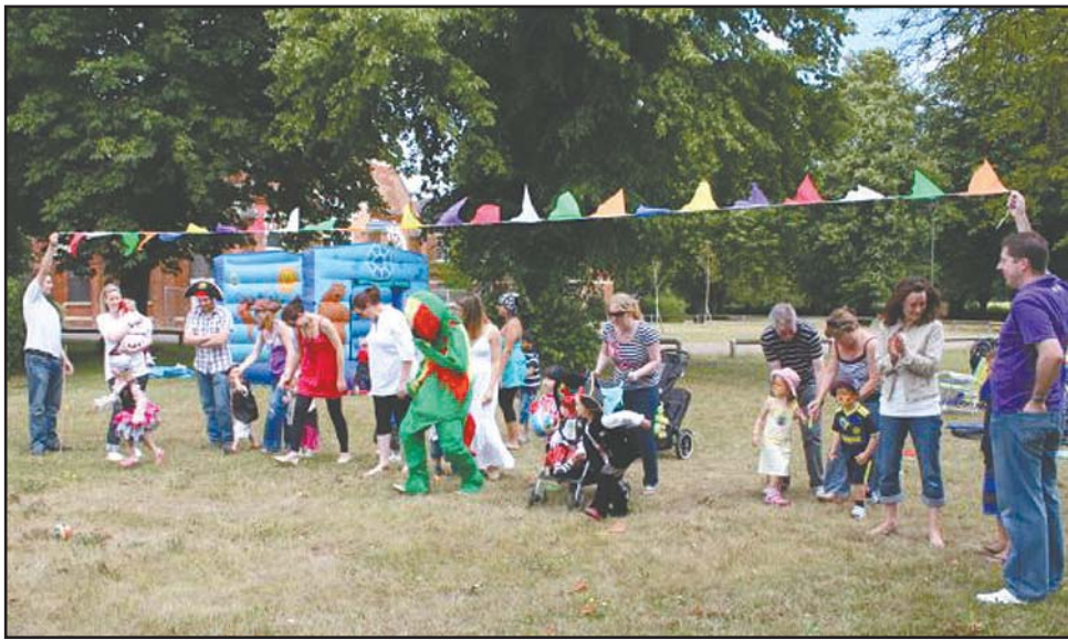
The starting line at last month's 'Big Toddle for Barnardos'.