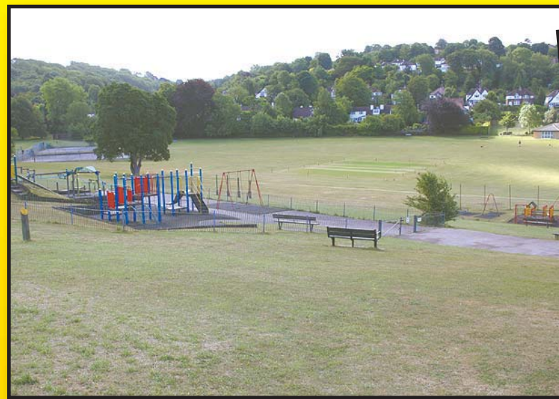
Whyteleafe Recreation Ground