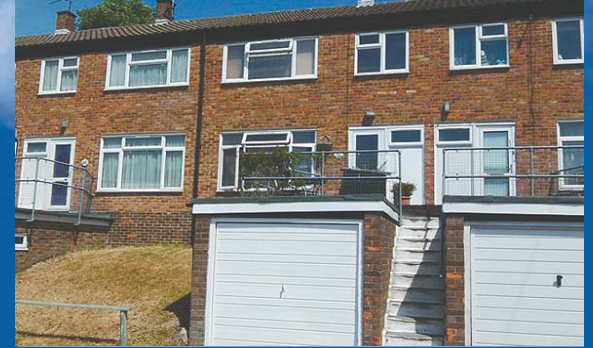
Caterham Valley - £239,950 100' REAR GARDEN

This 1929 built four double bedroom detached cottage style house is set on a corner plot with gardens to three sides and is full of character and charm