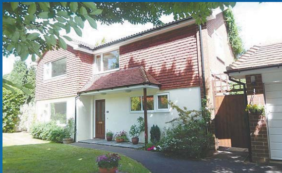
Chaldon - £635,000 RE-FITTED BATHROOM AND EN-SUITE

A three bedroom semi detached house with two reception rooms located in a popular road with a large South West facing garden and offered to the market with no onward chain.