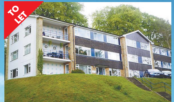
Caterham Valley - £795 pcm LOCATED CLOSE TO CATERHAM TOWN CENTRE

Immaculately presented four bedroom detached house which has been refurbished to an exceptional standard.