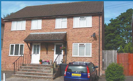
Caterham on the Hill - £245,000 SHORT WALK FROM COULSDON COMMON

A two double bedroom Victorian built semi detached house with two receptions and a secluded rear garden with a large paved patio. Viewing is highly recommended.