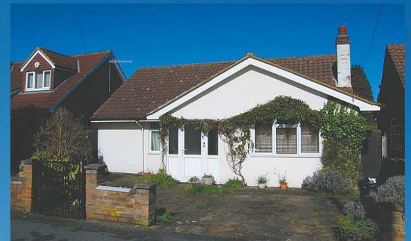
Caterham on the Hill - £299,950 TWO CONSERVATORIES

A modern three bedroom halls adjoining semi detached house with off street parking and a south westerly facing rear garden and located in a no through road.