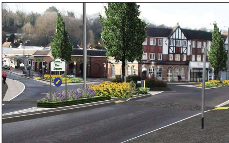
A digitally-created impression of how The Square will look after the current improvement works.