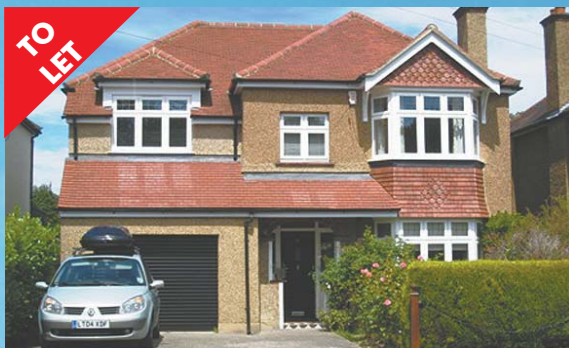
Caterham on the Hill - £1,750 pcm POPULAR RESIDENTIAL ROAD

A five double bedroom detached family home located in a sought after residential road on a large plot. The house has accommodation appointed over three floors.