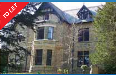
Caterham Valley - £800.00 PCM Harestone Valley Location Fully furnished two double bedroom split level apartment in large Victorian conversion

Caterham on the Hill - £169,950 Ground floor maisonette A two bedroom maisonette which is well presented and with the added benefit of off street parking for two vehicles.