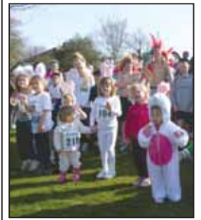
The line-up at last year's 1km Fun Run

The third Rotary Bunny Fun Run is being held in Queen's Park, Caterham on Sunday 28th March. Registration costs £5, or £10 on the day. To register for the 5km race or 1km Fun Run, call 01883 346641 for a registration form or visit www.rotaryruns.co.uk