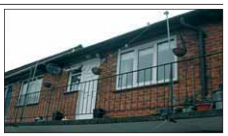
OXTED £695 PCM A 1 bedroom purpose built top floor flat, recently re-decorated, in a convenient location for town centre and station and benefiting from parking.