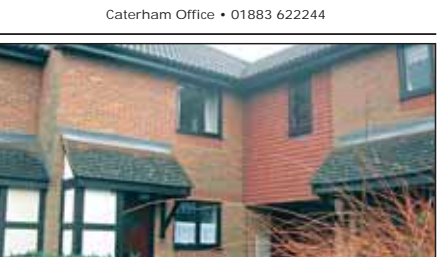
HORLEY £780 PCM A 2 bedroom house in Horley benefiting from enclosed rear garden & parking. Furnished or part-furnished.