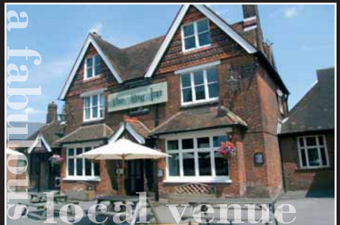
Visit our stylish restaurant for delicious home-cooked meals at credit crunching prices!