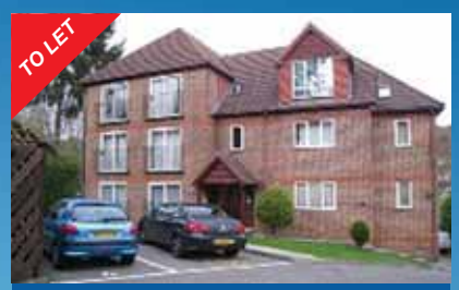
Kenley - £850 PCM Walking distance to Kenley station Spacious two double bedroom second floor apartment in quiet location and within a mile of Kenley station.

Caterham Valley - £179,950 Walking distance to Station A two bedroom ground floor purpose built flat located near to Caterham Valley and with no onward chain.