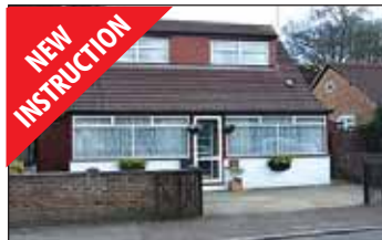
Caterham: £375,000 Four Bedroom Detached House 25' Living Room Conservatory

A RECOVERING SALES MARKET MEANS WE NOW HAVE AN INCREASING AMOUNT OF PROSPECTIVE PURCHASERS REGISTERING TO BUY.