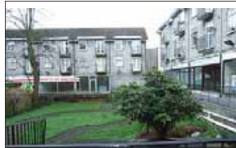
Caterham: £130,000 - £140,000 Two Bedroom Top Floor Apartment En Bloc Garage Balcony