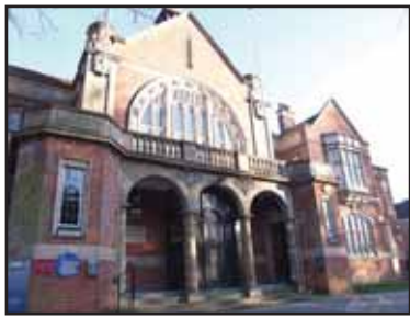
The Soper Hall in Caterham Valley

The Caterham Community Partnership ('CCP') is inviting local residents to express their views on the future of the Soper Hall in Harestone Valley Road.