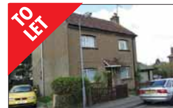
Caterham: £950 PCM Three Bedroom Detached House Two Reception Rooms Garage