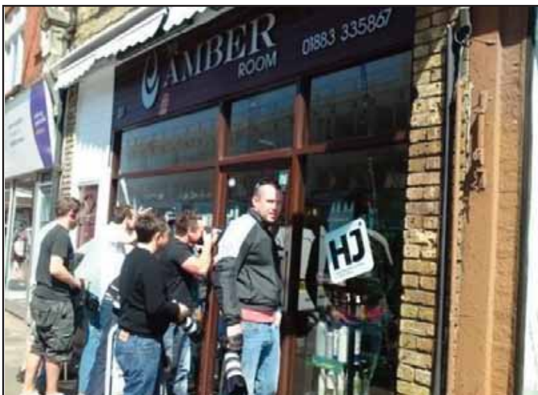
Who were the paparazzi trying to snap at the Amber Room hair salon in Croydon Road, Caterham last week? Go to www.caterham-independent for the full story!