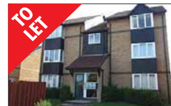
Croydon: £575 PCM Refurbished Studio Apartment Close to local Shops & Transport Off Street Parking