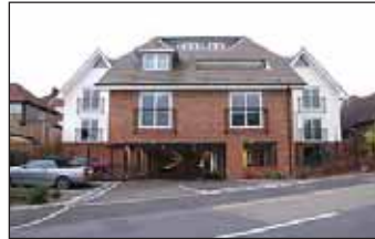
Caterham: £245,000 Penthouse Apartment With Balcony Patio Two Double Bedrooms Gated Parking