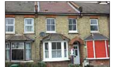
Redhill: £210,000 - £220,000 Two Double Bedroom Terrace House Close To Mainline stations Rear Garden