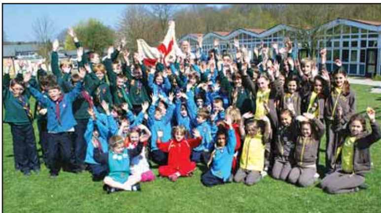
Pupils at St. John's CofE Primary School in Caterham celebrating St. George's Day.

(see above). To view more photos of the parade go to www.caterham-independent.co.uk or www.local-eventphotos.co.uk