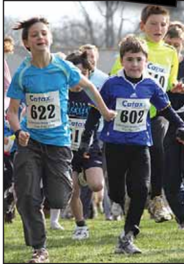
The Rotary Bunny Fun Run is one of the local events sponsored by Catax.

The team at Catax have a wealth of experience serving local needs, whether acting as hospital couriers or making simple shopping trips. Their cars are also used by Surrey County Council to transport children to and from school. The Catax fleet consists of several different types of vehicle, ranging from ordinary saloon cars to eight-seater minibuses. As members of the Taxi Voucher Scheme, participants of the scheme can expect all Catax drivers to accept vouchers.