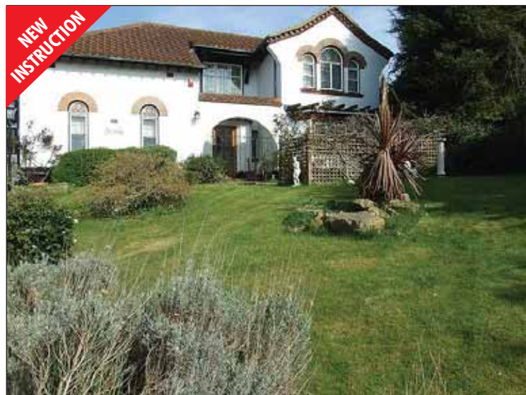
Sanderstead: OIRO £620,000 Three/ Four Bedroom Detached House Double Garage Large Plot