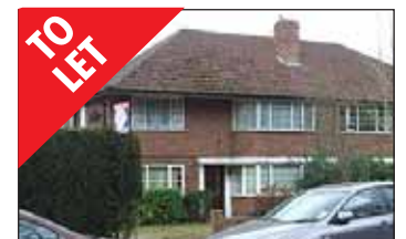
Redhill: £800 PCM Two Bedroom First Floor Maisonette Level Rear Garden Garage