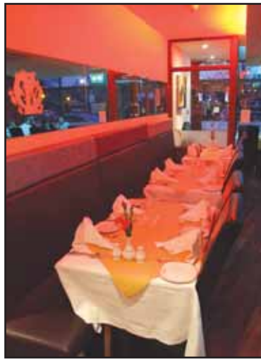
The Curry Leaf

the main courses turned out to be perfect to suit our tastes.