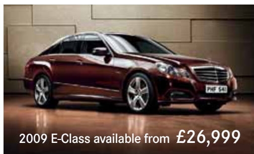
2009 E-Class available from £26,999