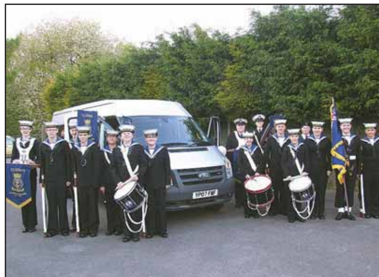
The Sea Cadets with their new minibus at their head-quarters in Caterham-on-the-Hill.

The Caterham Sea Cadets would like to say a big 'thank you' to the readers of The Caterham and District Independent who helped to fund the purchase of their new 17-seater minibus.