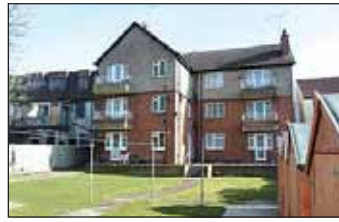
Whyteleafe: £139,950 Double Bedroom Top Floor Flat Gas Central Heating Convenient Location