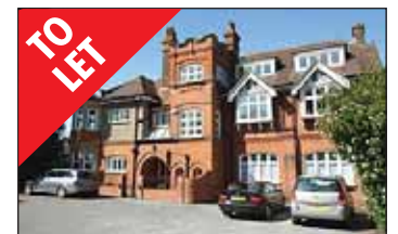
Caterham: £725 PCM One Bedroom Top Floor Flat Refurbished Garage