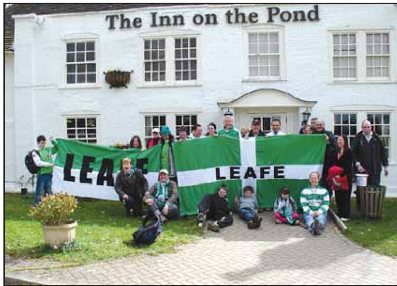
Sponsored walkers at their refuelling spot enroute to Merstham

Going into the final fortnight Croydon Athletic and Folkestone were vying for the title and Whyteleafe had their chance to play a part in deciding the winners. Leafe had to visit Folkestone on a Tuesday evening, before entertaining Croydon at home the following Saturday, with the top two then facing each other in the final week. Folkestone had only lost one league game at home all season so hopes weren't high, but Whyteleafe had proved previously in the season when beating Croydon away, that on their day they are a force to be reck-