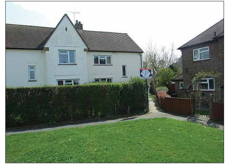
Caterham: £255,000 Three Double Bedrooms Semi Detached House Approx 80' Rear Garden