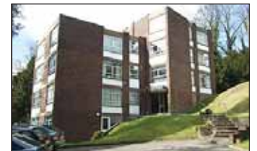
Whyteleafe: £175,000 - £180,000 Two Bedroom First Floor Apartment Close To Mainline stations Off Street Parking

DUE TO RECORD LETS WE URGENTLY REQUIRE YOUR PROPERTY. CALL US TODAY & GET YOUR PROPERTY LET!