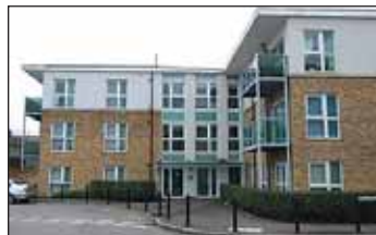
Caterham: £175,000 - £185,000 Two Double Bedroom Apartment Open Plan Living Room Allocated Parking