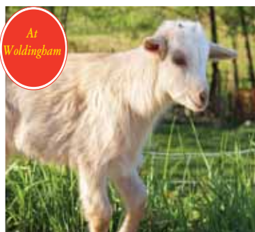
Cuddle Me Do Farm and Beaver World Animals