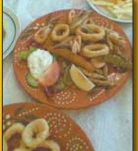
The 'Fritura Mixta' - one of the delicious tapas dishes served at Costa del Sol.