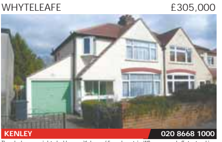
Three bedroom semi detached house with lounge/diner, downstairs WC, garage and off street parking. Featuring a new roof and boiler with further updating required. No onward chain.

Three bedroom house, large kitchen, double aspect lounge/diner, cul-de-sac location close to two stationes and the park. Front and rear gardens and no onward chain.