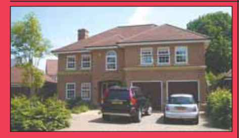
NETHERNE ON THE HILL (COULSDON) £2250 PCM om prestigious detached property located in a quiet pre on in the popular area of Netherne on the Hill, Coulsdon