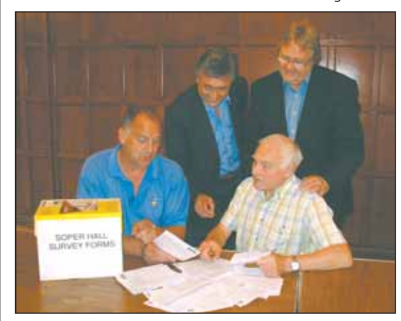
Members of the Soper Hall Group get ready to go through the results of the recent survey.

Independent. Over a hundred local people completed the survey, three quarters of them from Caterham Valley. The findings showed overwhelming support for the Soper Hall to continue as a historic venue for community activities and involvement. Suggestions for the hall's future were varied, with some believing it would