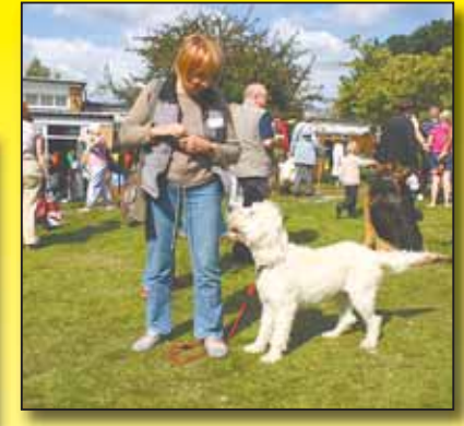
Labradoodle 'Flo' begs her owner for a treat.