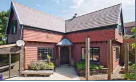
A unique two bedroom detached house set in a landscaped garden setting with detached double garage situated in a secluded position conveniently lowith detached double garage situated in a secluded position co cated for local stations. Viewing highly recommended. UPC0776