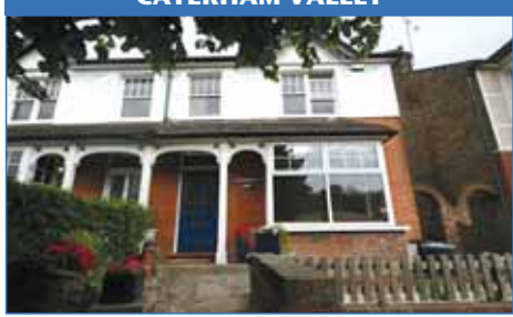
A substantial five bedroom semi detached period house boasting many characte features with the benefit of two parking spaces to front and offered to the with no onward chain. Viewing highly recommended. UPC0763