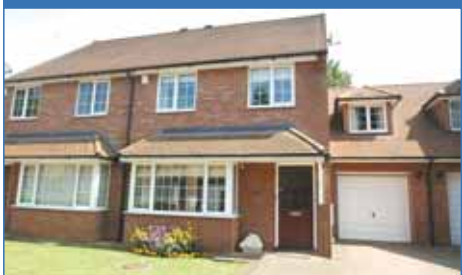
A modern four bedroom house with driveway, garage and level front and rear gardens situated in a private cul de sac location and offered in our opinion in e UPC0770 lent decorative order throughout. Viewing highly recommended.