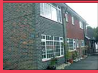
GODSTONE £1750 PCM