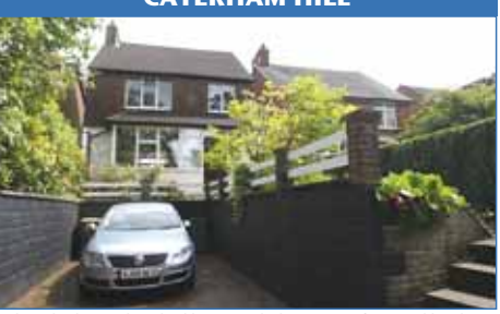
A three bedroom detached house with driveway to front and level rear garden. Lounge, Open Plan Kitchen/Dining Room, Conservatory, Modern Bathroom. Viewing highly recommended. UPC0758