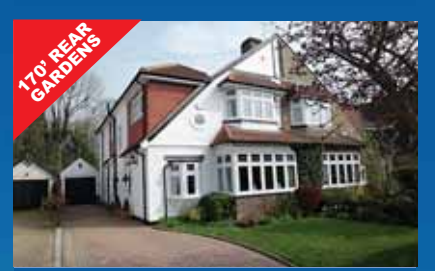
Caterham on the Hill - £459,950

An immaculately presented four/five bedroom extended family home, which in our opinion, is presented for sale in excellent decorative order. TO VIEW CALL 01883 348035