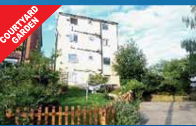
Caterham Valley - £174,950

Kenley Common. TO VIEW CALL 01737 551188