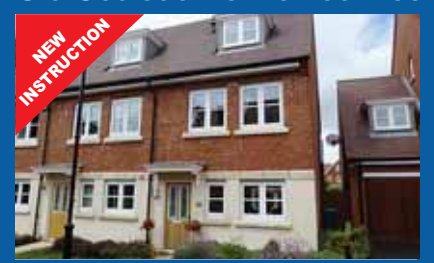
Kenley - £335,000

Old Coulsdon 01737 551188 - Caterham on the Hill 01883 348035 - Lettings 01883 343355