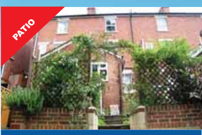
Caterham - £695 pcm

Well presented one bedroom ground floor flat with own entrance, bathroom with shower, modern kitchen, parking and own patio. Must be seen!