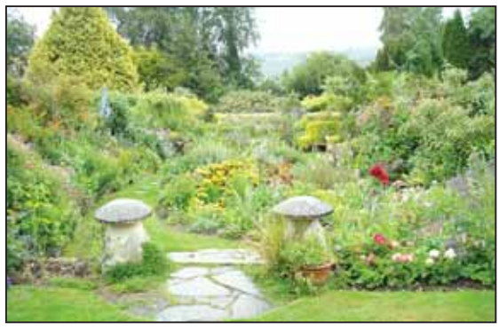
A recent photograph of Sue's garden in Caterham.

Sue is in the final four in the Daily Mail National Garden Competition 2011. Two finalists' gardens will feature in the August 6th edition of Weekend magazine and two in the 14th August edition before the winner is announced. Good luck Sue!