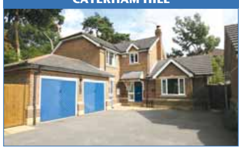
A detached four bedroom property in our opinion offered in immaculate decorative order and situated on the sought after Ham-