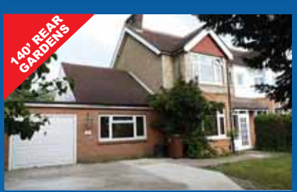
Caterham on the Hill - £439,950

An immaculately presented four/five bedroom extended family home, which in our opinion, is presented for sale in excellent decorative order. TO VIEW CALL 01883 348035