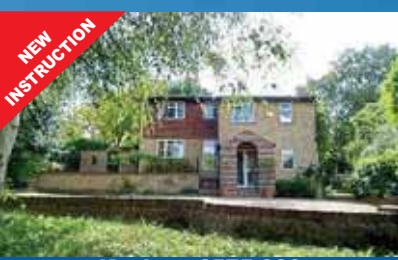
Kenley - £575,000

A most hospitable four bedroom, two bathroom, amily home enjoying a quiet cul-de-sac setting with an elevated woodland outlook towards