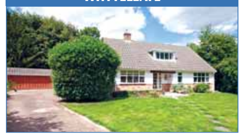
An opportunity to acquire a detached chalet style property previously granted planning permission for full loft conversion to incorporate two additional bedrooms and en suite bathroom on the first floor, the property occupies a plot of approx. 2 acres of land. UPC0769