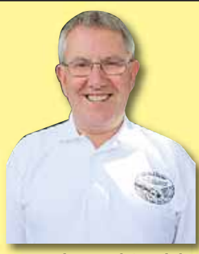
Favourite Food & Drink: Anything with custard; cold milk.

Pastimes: Fundraising for de Stafford PSA and C.O.A.T. and C.H.E.C.K. (Community Health and Education for the Children of Kimilili). Swansea City Supporter.