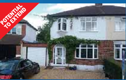
Old Coulsdon - £330.000

A ground floor, two bedroom maisonette benefiting from invaluable residents' parking, situated just six hundred yards from the heart of the town centre. TO VIEW CALL 01737 551188