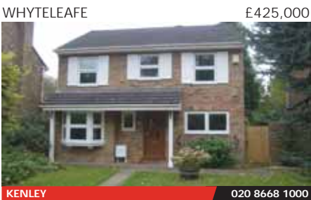
A four bedroom detached house with front and rear gardens, double garage and en suite to the maste bedroom. The property consists of three receptions including a study and downstairs W/C.

Large detached house with self contained two bed annex on a half acre level plot, in prime private cul-de-sac on the former 'Manor Park' estate. Currently arranged with four double bedrooms including master suite, up to five receptions.