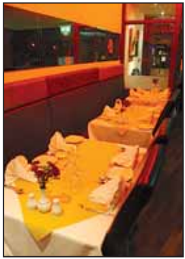
The comfortable interior of The Curry Leaf.

restaurant provides The great service and very pleasant surroundings and would Momtaj Chicken (chicken be a great choice for a ro-breast cooked in highly mantic meal for two this mantic meal for two this Valentine's Day. For more in-formation or to book a table call 01737 558899.