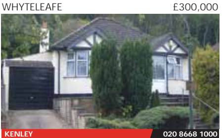
An extended detached bungalow situated on the popular valley side providing two b receptions including a kitchen adj family room a breakfast/sun room, garage and OSP.

A well presented two bedroom ground floor flat which features lounge/diner, refitted bathroom, gch and patito/balcony.