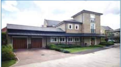
A stunning contemporary style detached house offering an impressive 3,200 sq ft of accommodation overlooking surrounding countryside and situated within a unique village setting. UPC1065