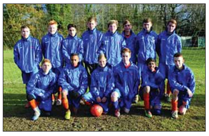
The Under 15s in their smart coats sponsored by Bib & Tucker Dry Cleaners.

The Caterham Pumas are holding a fundraising Darts Competition on Sunday 17th February in Caterham-on-the-Hill. For more details see What's On on page 11.