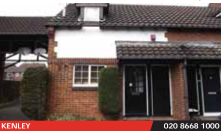
One bedroom freehold house with private garden and parking located within a quiet cul de sac in close proximity to both Whyteleafe and Upper Warlingham Stations. No onward chain.