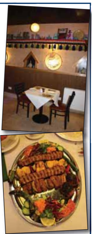
Our sumptuous main course.

food is that it is beautifully flavoursome without being too spicy, but why not pop down to Crovdon Road and try this exciting new restaurant yourself?