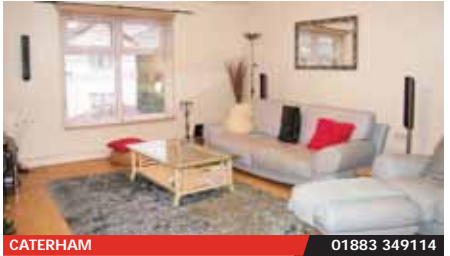
A well presented, split level , two bedroom maisonette situated close to local shops and transport links. The property, which is arranged over two floors, features a double aspect lounge, two double bed-rooms, a 15' bathroom and planning consent to create a roof terrace: