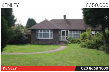
A spacious two double bedroom, two reception, refurbished semi detached bungalow with garage and off street parking situated on a level plot in close proximity to Kenley Common. No onward chain.