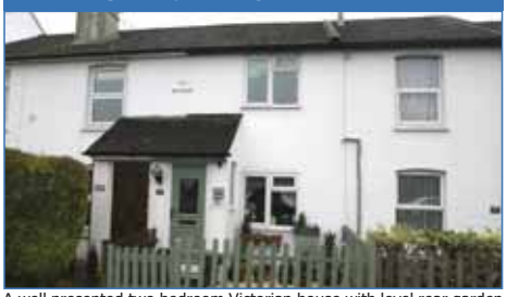
A well presented two bedroom Victorian house with level rear garden situated in a highly sought after residential road and offered to the market with no onward chain. UPC1055