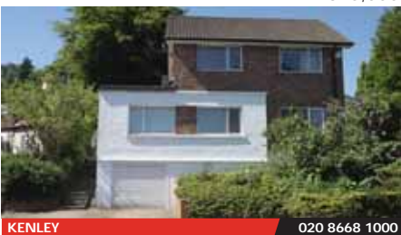
Well presented two double bedroom detached house with planning permission to extend to four bed-rooms. Two receptions, extensive views over the valley, large lounge/diner and kitchen (21ft), garden, garage and OSP.