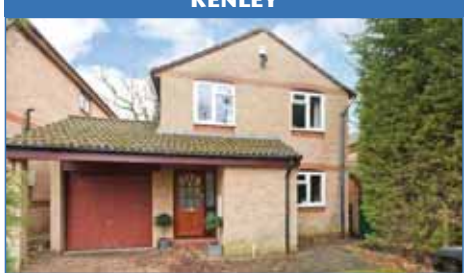
A four bedroom detached family home with driveway garage and se cluded rear garden situated in the popular village of Kenley. Viewing highly recommended. UPC1057 ley. Viewing UPC1057