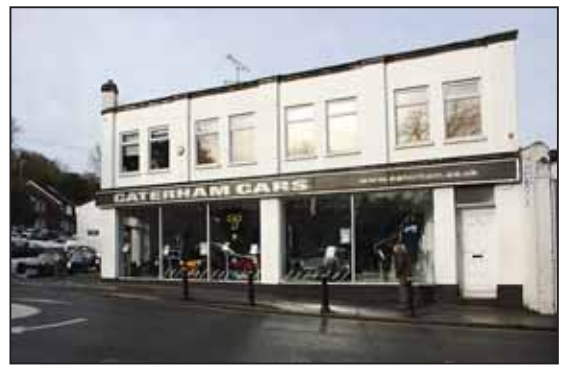
The Caterham Cars showroom in Station Avenue, Caterham.

"Our brand proudly takes its very name from the town in which it was founded by the Nearn family and it is particularly poignant that, just as Caterham Cars begins an exciting new chapter in its history, it is moving away.