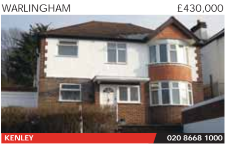
Four bedroom detached house with large rear garden, two receptions, two separate garages. Requires some updating. Close proximity to two stations, no onward chain.