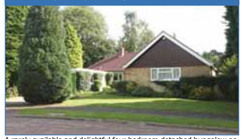
A rarely available and delightful four bedroom detached bungalow oc-cupying a well established level plot with driveway and double garage situated in a highly sought after cul-de-sac location. UPC1003