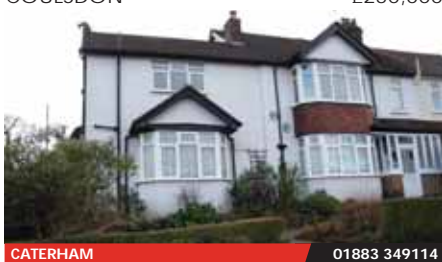
Spacious rooms, open outlook, double aspect rooms and a convenient location are all features of this split level, top floor conversion apartment in a popular location in Coulsdon. The property benefits from an 18' Lounge, 18' Kitchen/breakfast Room, 17' Bedroom.