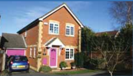
A three bedroom detached property with the benefit of a co situated on the popular Hambledon Park development. UPC1061