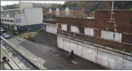
The Rose & Young building in Croydon Road, Caterham.

Please send your views about the future of the Rose & Young building to editor@caterham -independent.co.uk for publication in the February edition.