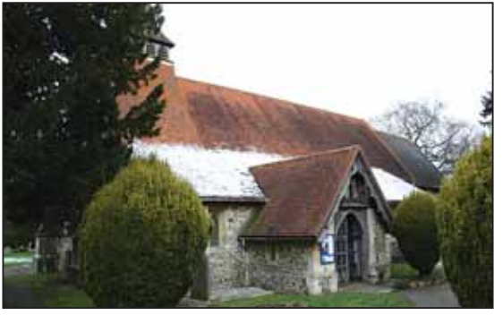
All Saints' Church in Warlingham.