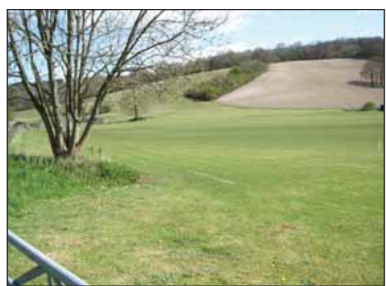
Marden Park, Woldingham.

Refreshments are available in Knight's Garden Centre in Woldingham Road.