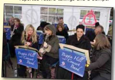
The Biggin Hill Concert Band.

On Saturday 1st December over 1,500 people attended the Christmas Fair and the 35 local craft stallholders generally reported record takings and a bumper