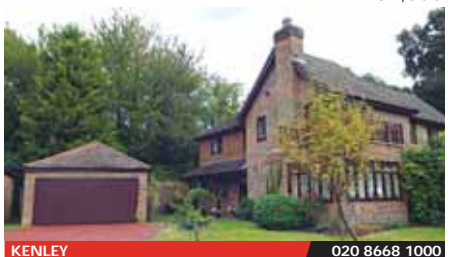
Five bedroom, four reception, three bathroom house with a level plot located at the end of a sought after cut do sac in the heart of Kenley. Features own private wood, double garage and in proximity to Kenley Common and The Hayes School.