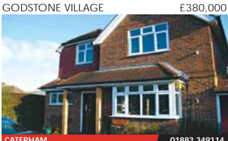
Situated in the popular village of Godstone, this three double bedroom detached house has been improved and extended by the current owners. The property features a double aspect through lounge/diner with bay window to the front and patio doors to the garden. The refitted kitchen features slate flooring with under floor heating.