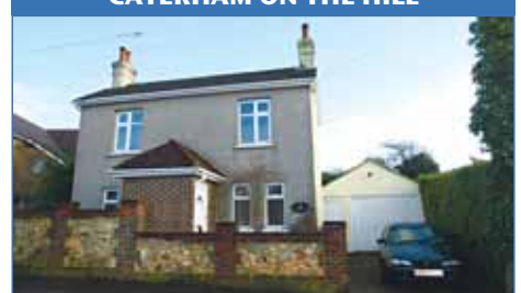
A three/four bedroom detached property offering versatile accommoda-tion situated in a popular residential location and offered to the market with no onward chain. UPC1051