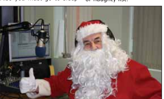
Father Christmas at Ridge Radio.

In the week of Monday 10th December, Caterham Rotary Club and Father Christmas went around the local streets with their Christmas float to raise money for local charities and allow Father Christmas to meet some of the children who had sent him Christmas lists and check whether they should be on the good or naughty list!