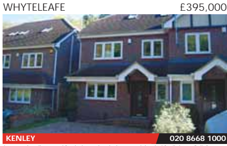
An extremely well presented four bedroom, three bathroom semi detached family home. Built four yea ago the house has had no expense spared with a new contemporary klitchen, four double bedrooms, two with ensuites, a family bathroom, conservatory, klitchen/family room, downstairs WC and parking to the force!