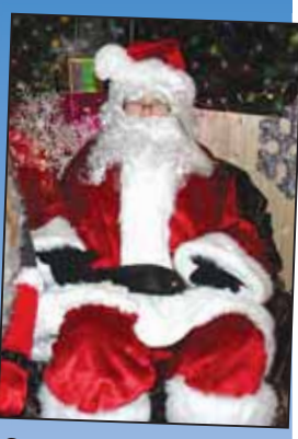
Santa in his grotto in 'Potters Music Shop'.