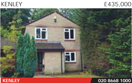
A very well presented, deceptively spacious four bedroom, two bathroom detached house located a quiet cut de sac backing onto Kenley Common. The property features an extended lounge/diner, large kitchen/breakfast room, downstairs shower room, driveway with off street parking.