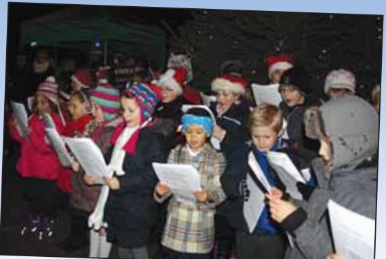
Children from Merstham Primary School singing carols to entertain the shoppers.