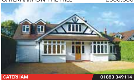
A three/four bedroom detached chalet bungalow situated in the Whyteleafe Road area of Caterham. The property has been substantially updated and improved by the current owners, whilst it does still offer further scope for extension. Large level garden.