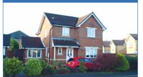
A three bedroom detached family home offered to the market in our opinion in excellent decorative order throughout with driveway and level rear garden situated on the highly sought after Hambledon Park devel-UPC1050