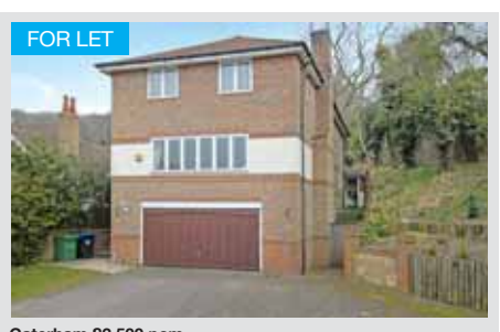
Caterham £2,500 pcm A spacious 5 bedroom family home, offering versatile space and situated on a popular close. EPC:D