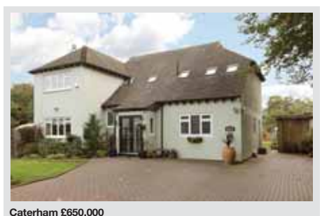
In an idyllic location is this beautifully presented detached house with flexible living space totalling 2357 sq ft. EPC:E