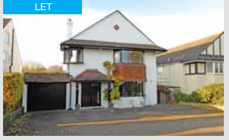
Purley £2,750 pcm A beautiful 5 double bedroom detached family home situated in popular cul-de-sac on the favoured West Side of Purley. EPC:E