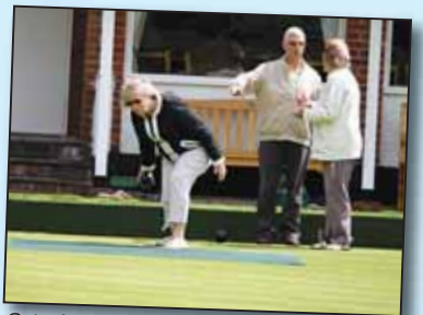
Caterham Bowling Club.