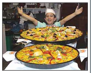
Delicious paellas at Costa del Sol.