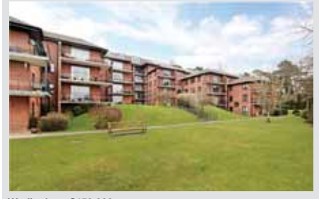
Warlingham £450.000 A spacious split level 3 bedroom apartment within a prestigious development with stunning far reaching views. EPC:D

Caterham O.I.E.O. £250,000 A 3 bedroom semi-detached property on a no through residential road with level garden and off street parking. EPC:D