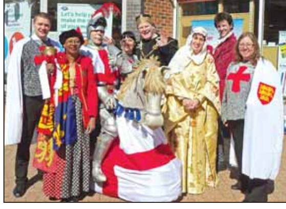
Staff from Church Walk Shopping Centre with St. George and members of the Far Isle Medieval Society.