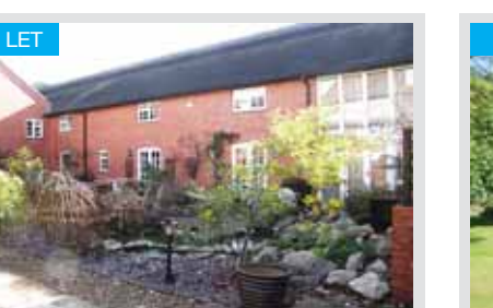
South Nutfield £2,695 pcm A beautifully appointed converted farm building dating back to the 1890's and recently refurbished to a very high standard. EPC:F

Hamptons Caterham & Oxted Sales. 01883 759487 Lettings. 01883 759489