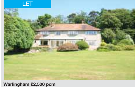
A stunningly located five bedroom character house, situated on private land with far-reaching views of Woldingham valley. EPC:E

Hamptons Caterham & Oxted Sales. 01883 759487 Lettings. 01883 759489