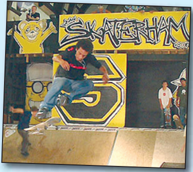
Action at Skaterham,