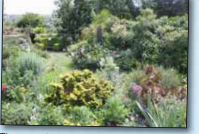
The award-winning garden at 116 Burntwood Lane, Caterham.

3pm-4.30pm and every Sunday throughout the summer. Come and see the famous mural in this 900 year old church.