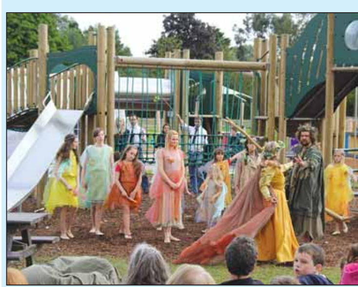
Oberon, Titania and the Fairies played by the Another Way Theatre Company created a magical scene in Queens Park at last year's Caterham Festival.

Shakespeare in Queens Park, Caterham. After the popularity of A Midsummer Night's Dream last year, Another Way Theatre is thrilled to have the to produce leafe Tavern. Music and the Shakespeare's Antony & craic. See www.caterhamfes- Cleopatra. Their vivid telling of the story offers a fresh look 7pm Carry on Captain - A at the epic nature of the Murder Mystery Night at The doomed love affair that Arc, Caterham. £27.50 for realized the appeart show and three course meal rocked the ancient world. and of course plenty of op- Tickets from £8.00 from portunities to sleuth! The Arc www.anotherwaytheatre.co.