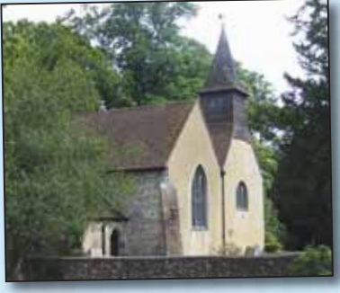
St Lawrence's Ancient Church.