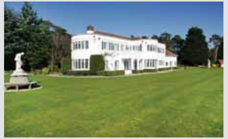
Birch Hill, Shirley Hills £4,500 pcm An impressive five bedroom detached art deco style house, with stunning rear gardens, situated on the sought after Birch Hill. EPC: D