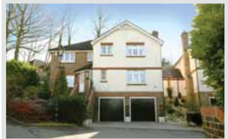
Clareville Road, Caterham £2,500 pcm A beautifully presented four/five bedroom family home offering bright and spacious accommodation over two floors. EPC: D