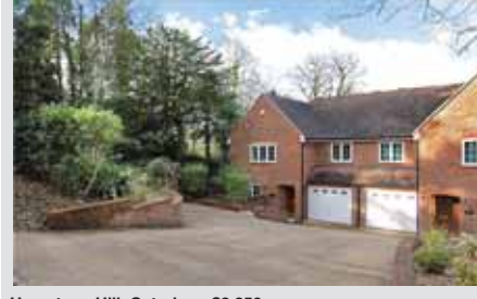
Harestone Hill, Caterham £2,250 pcm A spacious four bedroom family home, offering versatile space and situated on a popular road, located less than half a mile from Caterham town centre. EPC: C

Hamptons Caterham & Oxted Sales. 01883 759487 Lettings. 01883 759489