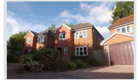
Asprey Grove, Caterham £1,500 pcm A well presented 3 bedroom link detached house close to Caterham station and within easy access to the M25 (J6) EPC: D

Hamptons Caterham & Oxted Sales. 01883 759487 Lettings. 01883 759489