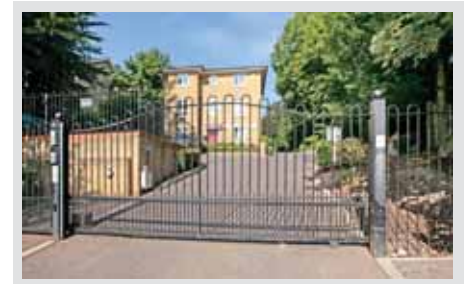
Caterham Guide price £275,000 Stylish 2 bedroom, 2 bathroom apartment located on the first floor of a gated development convenient for Caterham. EPC: B

Beyond your expectations www.hamptons.co.uk