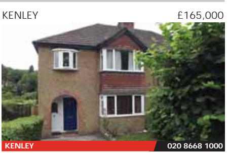
One bedroom ground floor character maisonette with private garden and parking. Proximity to Kenley station. No onward chain.

Very well presented two double bedroom split level flat on the Kenley/Whyteleafe borders in proximity to Kenley station. New lease and no onward chain.