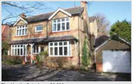
The Heath, Caterham £2,500 pcm A delightful four bedroom family home situated on a quiet private road, with a beautiful mature garden. EPC: E