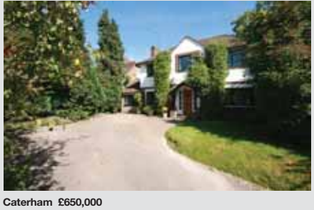
Four bedroom family home having been refurbished to an exacting standard throughout, set in 0.26 acres. EPC: C