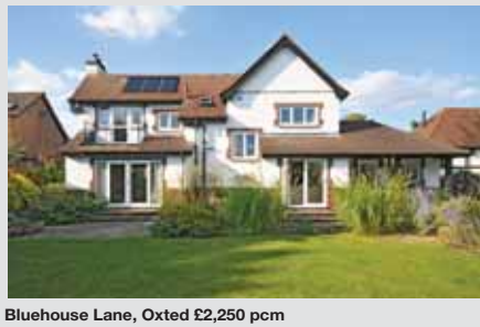
A beautifully presented three bedroom, double fronted home with excellent access to local schools and brilliant commuter links into London. EPC: D