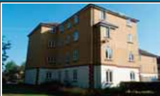
Caterham on the Hill - £995pcm

2 bed ground floor flat with a bit of outside space and parking for one car. Available unfurnished now.