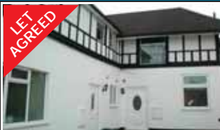
Kenley - £795pcm

Lovely bright 2 bed first floor apartment in converted manor house in extremely quiet country location. Over 15 acres of grounds to enjoy. Available now.