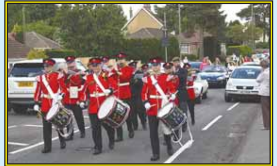
The Warlingham Flute band marching to the Warlingham Fair last year.

11am and 2pm The Wabbit King (See 7th June entry for details.)