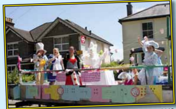
The Alice in Wonderland float at the Caterham Carnival in 2013.