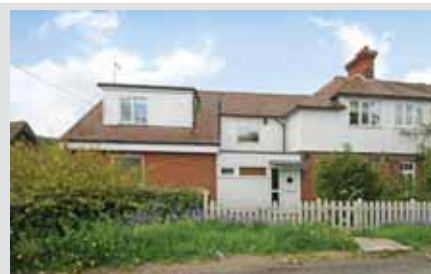
Bugg Hill, Woldingham £2,500pcm 4 bedroom home enjoying views across Woldingham. EPC: F Hamptons Caterham & Oxted 01883 759489