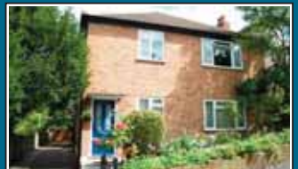
Caterham Valley - £1000pcm

Quaint 2 bed ground floor maisonette with fitted kitchen, neutral decor, private garden and garage. Close to town centre and train station. Available now.