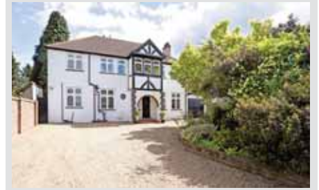
Buxton Lane, Caterham OIEO £690,000 Family house with secluded garden. EPC: E Hamptons Caterham & Oxted 01883 759487