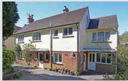
Harestone Hill, Caterham OIEO £650,000 Extended 4/5 bedroom family house with views. EPC: F Hamptons Caterham & Oxted 01883 759487