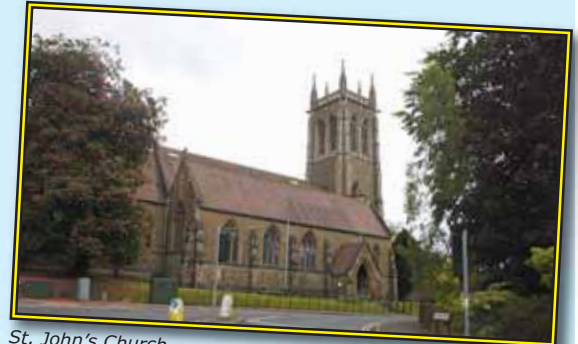
St. John's Church.