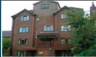
Caterham Valley - £825pcm

1 bed first floor apartment with large lounge and fantastic views. Ample storage and garage available.