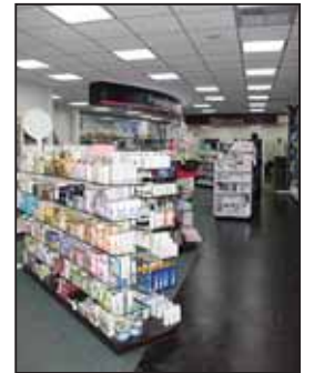
The refurbished interior of Vitaltone Pharmacy.

women's fragrances. With a gift-wrapping service and hundreds of gorgeous gift items for sale, Vitaltone is a great place to go if you need to find the perfect present for someone. With household items and cosmetics also available in the store, Vitaltone is a genuine local Aladdin's Cave!