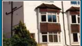
Caterham Valley - £895pcm

A spacious one bed first floor flat with a balcony in a sought after location. Bedroom includes fitted wardrobes. There is plenty of storage space and parking. Available unfurnished.