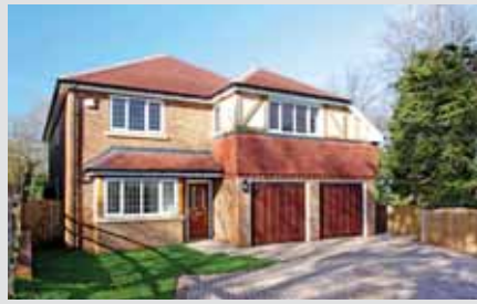
Tupwood Lane, Caterham £795,000 Ready for immediate occupation. EPC: B Hamptons Caterham & Oxted 01883 759487