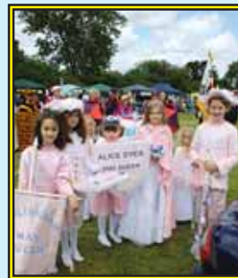
The Warlingham May Queen 2013 and her attendants.