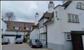
Woldingham - £825pcm

1 bed first floor apartment with large lounge and fantastic views. Ample storage and garage available.