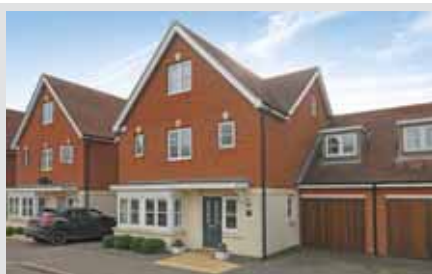
Fenemore Road, Kenley £2,250pcm Well presented 5 bedroom property. EPC: C Hamptons Caterham & Oxted 01883 759489