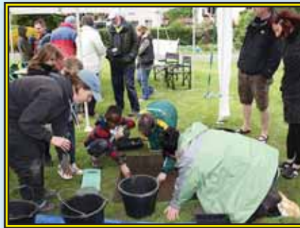
The Archaeological Dig.