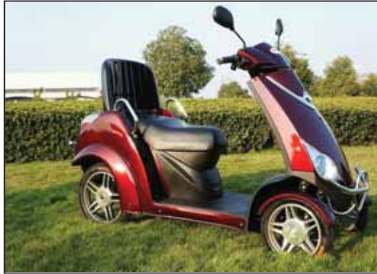
The Duchess Twin Seat.

Tony said: "Originally we were just wholesalers and my mum used to ride one of our scooters. After she died we decided to open the shop. We knew she would be very proud and decided to name the shop in her