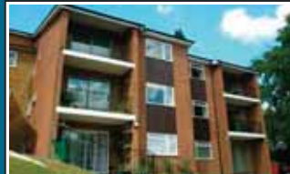
Caterham Valley - £850pcm

2 bed first floor flat with separate kitchen and lounge. Neutral decor throughout. Unallocated parking available.