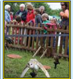
An owl at the birds of prey display.