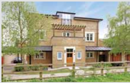
Stirling Drive, Caterham Guide Price £750,000 Idyllic location and 33ft family living area. EPC: C Hamptons Caterham & Oxted 01883 759487