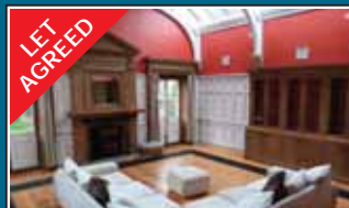
Caterham Valley - £1195pcm

Recently refurbished 2 double bedroom ground floor flat in sought after location within walking distance of town centre, shops and train station. Available unfurnished.