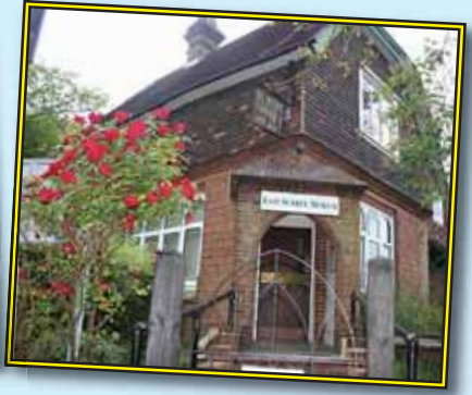
East Surrey Museum.