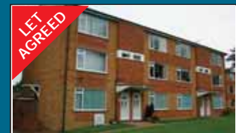
Caterham Valley - £895pcm

Well presented three bedroom semi-detached family home situated in quiet close within minutes walk of Godstone village green with good sized rooms and large level rear garden.