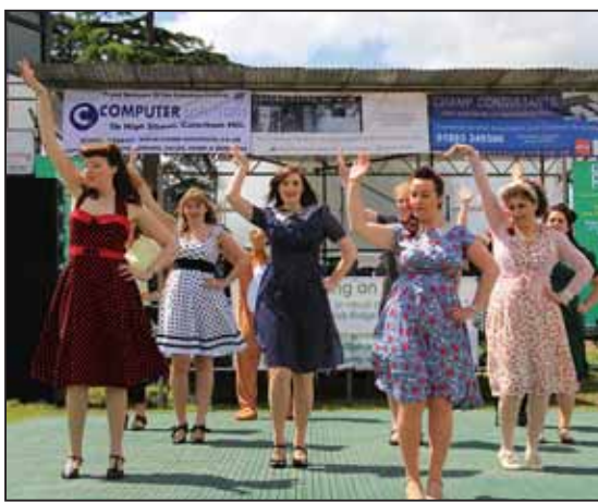
Dancers get Day 2 of DeFest off to a swinging start.

Festival which is putting Caterham firmly on the map. Events such as the 'Waller Pain' cycle ride up Waller Lane has become a popular event on the cycling calendar with serious cyclists travelling to Caterham from far and wide to take part in the gruelling challenge. The event could not take place without the hard work and enthusiasm of the Caterham Festival volunteers, so look out for them this month in their distinctive, green T-shirts. For more information about the Caterham Festival, visit www.caterhamfestival.org