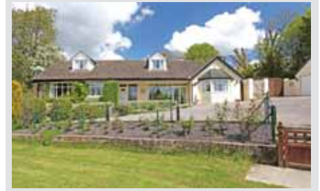
Harestone Hill, Caterham Guide Price £799,000 Family house with secluded garden. EPC: D Hamptons Caterham & Oxted 01883 759487