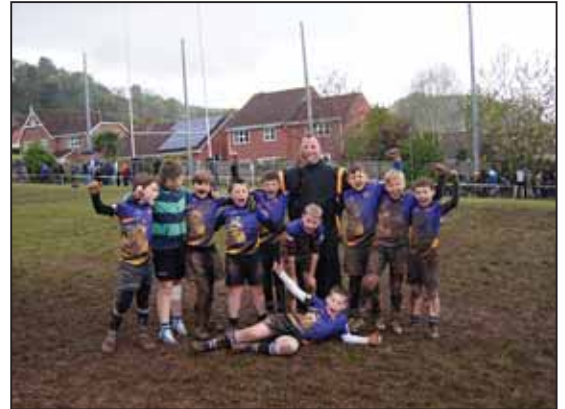
The triumphant Under 10s

Old Cats are based in Park Avenue, Caterham. We start from under 6's, through to our Veterans squad for both boys and girls. The club is based around building friendships and having fun. The season starts again in September and we look forward