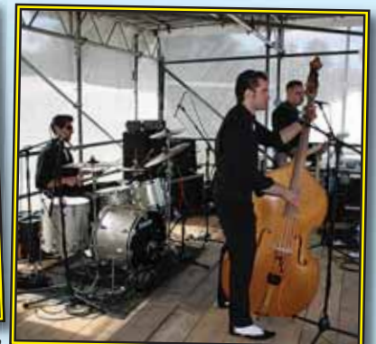
Rock 'n Roll Band 'Vintage' performing on Day 2.