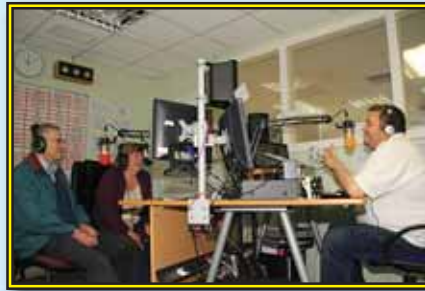
Ridge Radio.

Caterham Barracks Coulston Road, Caterham Hill. The Guards Depot until 1990, a fine example of the reform of barrack design following the Crimean War. Meet outside the Officers' Mess at 4pm for an approximately two hour tour.