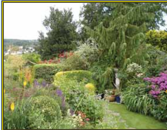
The award-winning garden at 116 Burntwood Lane.

2pm-6pm Garden Open - 116 Burntwood Lane, Caterham. Award-winning garden. A sloping, awkward site, built on many levels to 'take you on a journey'. Teas available, but space limited. Visitors need to be sure-