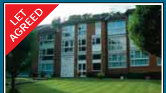
Caterham Valley - £1100pcm

Quirky 2 bed apartment with large spacious lounge. Double bedroom mezzanine overlooking lounge. Walking distance to shops and station. Available now unfurnished.