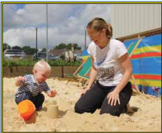
The Caterham Beach outside de Stafford Sports Centre.