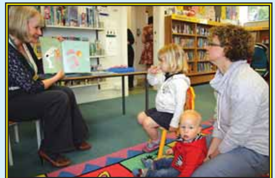
Story Time at Caterham-on-the-Hill Library in Westway every Friday at 2.15pm and at Caterham Valley Library in Stafford Road, every Tuesday at 2.15pm.

Chaldon Church Teas, every Sunday, 3-4.30pm. Teas at this 900 year old church in the woods.