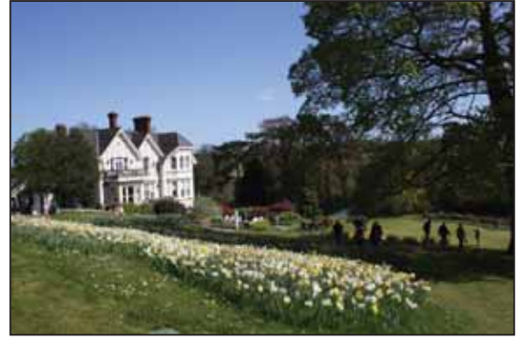
The fabulous display of daffodils at The Chalet.