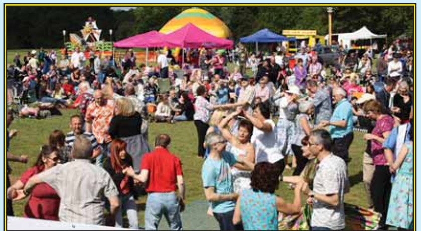
Dancers swinging in the sunshine on Day 2.