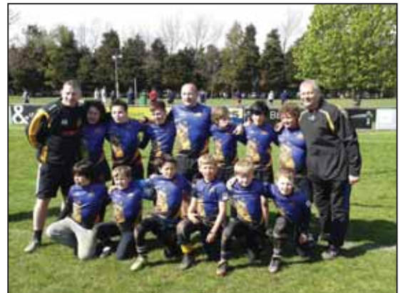
The Under 11's after their tournament in Sussex.

to welcoming new members. Visit www.facebook.com/Old-CatsMinis and www.pitchero.com/clubs/old-caterhamiansrfc