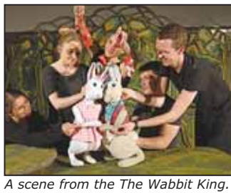
A scene from the The Wabbit King.

For full details see Saturday 7th June on page 2