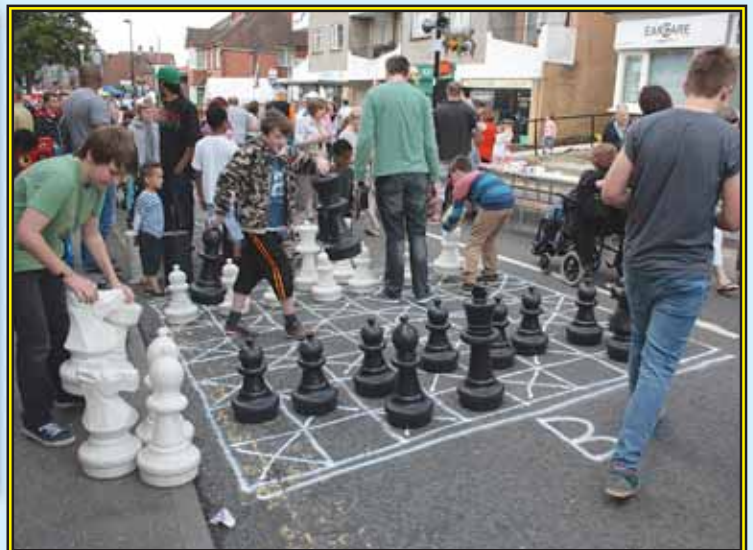
The giant game of chess in the High Street at last year's Street Party.

For full listings and updates to the Caterham Festival Programme visit www.caterhamfestival.org