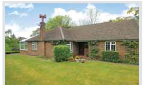
Tupwood Lane, Caterham £2,000 pcm 3 bedroom detached bungalow with mature gardens. EPC: C Hamptons Caterham & Oxted 01883 759489

Hamptons Caterham & Oxted Sales. 01883 759487 Lettings. 01883 759489