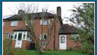
Godstone - £1475pcm

Quaint 2 bed ground floor maisonette with fitted kitchen, neutral decor, private garden and garage. Close to town centre and train station. Available now.