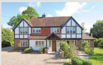
Millers Lane, Outwood £4,000pcm Beautifully presented 4/5 bedroom set in 1.2 acres. EPC: C Hamptons Caterham & Oxted 01883 759489