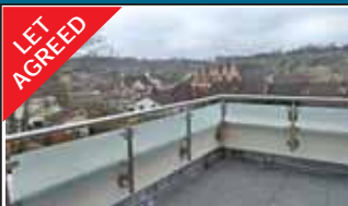
Whyteleafe - £975pcm

Superb one bed ground floor maisonette in quiet location. Close to train station and local amenities. Garden and shed available. Unfurnished.