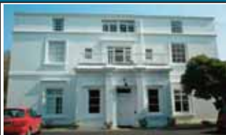
Tandridge - £1250pcm

Completely redecorated and spacious two bedroom first floor flat in popular development close to amenities and benefiting from two parking spaces.