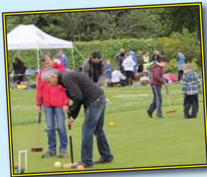
Caterham Croquet Club.