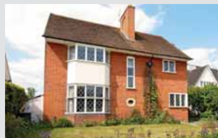
Quality Street, Merstham £2,750pcm 5 bedroom property, close to the village and station. EPC: E Hamptons Caterham & Oxted 01883 759489