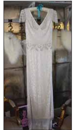
One of the beautiful vintage dresses for sale at Helena Fortley Bridal Boutique.