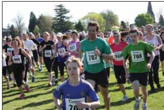
Runners at this year's Caterham Rotary Bunny Fun Run.

Further support and sponsorship has been agreed with