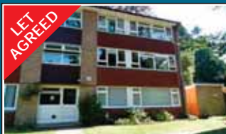
Caterham Valley - £975pcm

Brand new one bedroom top floor apartment in convenient location within walking distance of two train stations. Allocated parking included. Available immediately unfurnished.