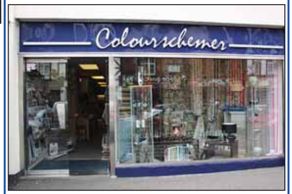
The Colourschemer store in Croydon Road, Caterham.

best possible products and We offer a complete servservice available in the UK ice from wallpaper sales to by combining our unique design and project manblend of knowledge and agement, from measuring skills developed over the curtains to final fitting. last 40 years. We work Visit our website with leading suppliers in www.colourschemer.co.uk