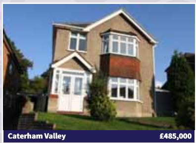
An opportunity to acquire a well presented detached house set in beautifully maintained landscaped gardens with driveway leading to double garage to rear. Internal viewing highly recommended to fully appreciate this unique family home