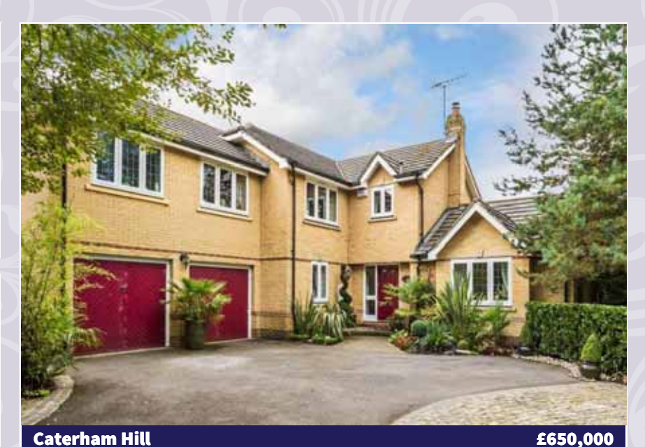
An opportunity to acquire a stunning detached residence boasting three good sized bedrooms all of which are ensuite and beautifully maintained landscaped front and rear gardens situated in a prime position within the highly sought after Hambledon Park development. EPC Rating D UPC1444