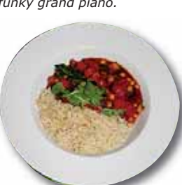
Ratatouille, spinach and chickpea stew with rice.

Musical members of the audience are welcome to play the piano before or after the night's professional entertainment, which is all