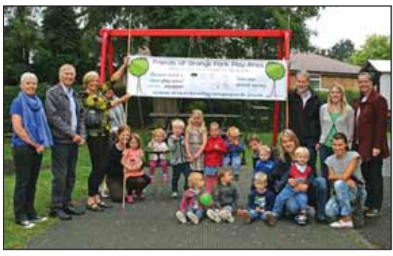
Members of the Friends of Grange Park Play Area and their children launch their new banner in Grange Park.

For further information e-mail friendsofgrangepark@gmail.com