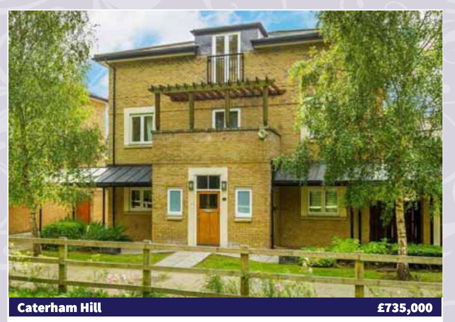
A stunning five bedroom detached property with contemporary open plan design situated on the unique Village development. Internal viewing is highly recommended. EPC Rating C UPC1440

Park & Bailey 1953-2014 Celebrating over