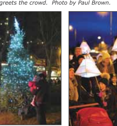
The beautiful Christmas Tree on Warlingham Green.