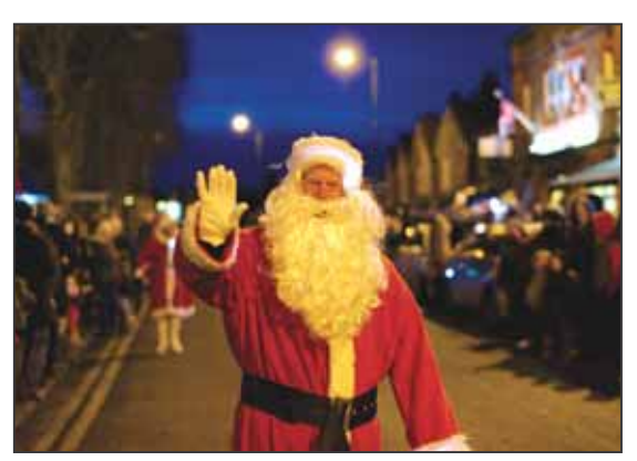
Santa greets the crowd.

After the lights were illuminated, children from Warlingham Park School, Warlingham Village School, Hamsey Green School and Whyteleafe School sang a rousing medley of Christmas songs to get everyone into the festive spirit. Many visitors took advantage of the late night opening to do some early Christmas shopping in the shops around the Green.