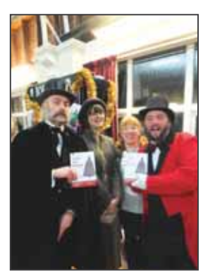
The cast of Jack the Ripper in Warlingham Church Hall.