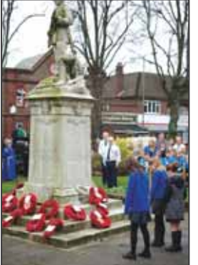
Children laving a wreath at Warlingham Memorial.