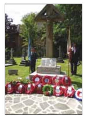
The memorial at St. Luke's Church in Whyteleafe.