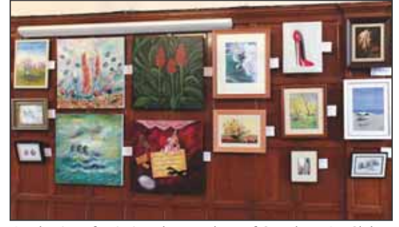
A selection of paintings by members of Caterham Art Club who were exhibiting for the first time.

New members are always welcome at the club. For more information visit caterhamartgroup.org.uk