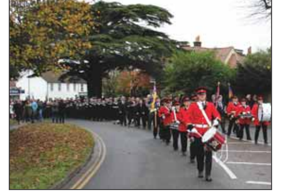
The Surrey and Sussex Drum and Bugle Corps lead the parade round to St. Lawrences's Church.