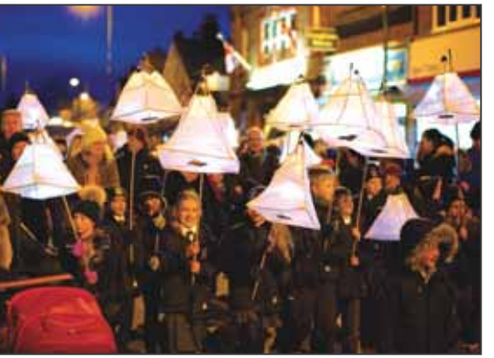
Children taking part in the lantern parade, Photo by Paul Brown,