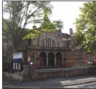
The Soper Hall, Caterham.

The Wedding Fayre will feature over 20 stalls, a fashion show