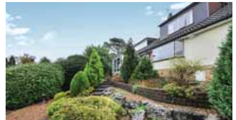
KENLEY 020 8668 1000

Five bedroom, two reception, three bathroom detached chalet bungalow with views over the valley. Close proximity to Kenley Station. Double garage and OSP.