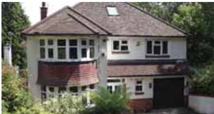
KENLEY 020 8668 1000

Five bedroom detached house in rural location adj. to Kenley Common. Arranged over three floors, extended to rear. Close proximity to Kenley Station. No onward chain.