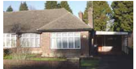
KENLEY 020 8668 1000

Three bedroom semi detached bungalow located within a sought after location. Level plot, garage and OSP. No onward chain.