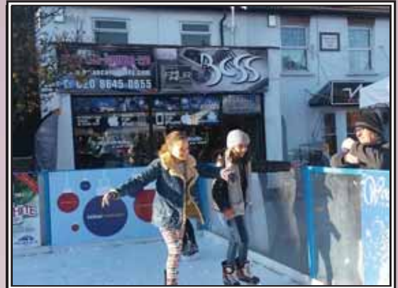
Youngsters having fun on the open air ice rink.

Anyone interested in sponsoring next year's Coulsdon Yulefest can contact the organisers by e-mailing info@yulefest.co.uk