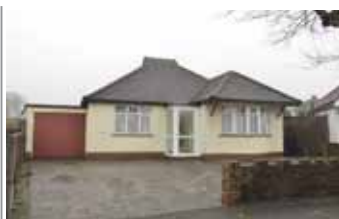
SOUTH CROYDON £365,000

An extremely well presented 3 double bedroom detached bungalow with large double garage. Located in a sought after residential road within third mile of Upper Warlingham Train Station. Potential for loft conversion to create additional space. A particular feature of this attractive bungalow is the superb south facing level rear garden. EPC: E Warlingham Office • 01883 622258