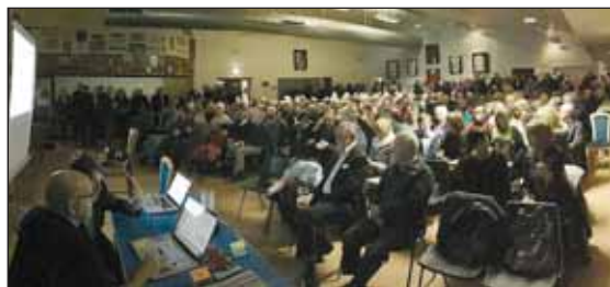
The packed meeting in Warlingham Rugby Club.

On Wednesday 26th November almost 400 people turned up at a meeting at Warlingham Rugby Club to make their feelings known about proposals to restructure Warlingham Green.