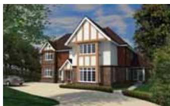
DORMANS PARK £2,000,000

Set in a highly desirable Dormans Park location, Pennethorne House is an impressive brand new home arranged over 3 floors. This outstanding house provides versatile accommodation with a floor area of approximately 6,000 sq.ft. EPC TBC. Caterham Office • 01883 347446