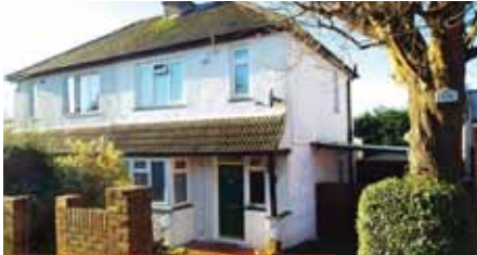
CATERHAM 01883 349114

An extended, three bedroom, semi-detached house situated in a popular residential location. The property features extended ground floor accommodation and now benefits from a fitted kitchen breakfast room opening onto a family room overlooking the rear garden. Three bedrooms and a bathroom to the first floor.