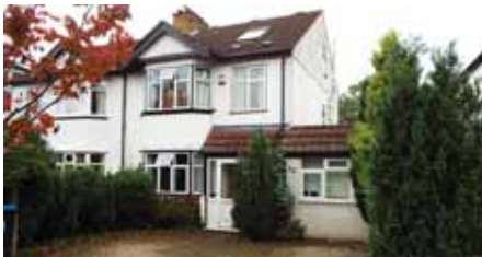
CATERHAM 01883 349114

Situated in a popular location close to St. John's School offers descriptively spacious accommodation arranged over three floors. There is an extended kitchen/diner and open plan family area and doors leading to the garden. This room really is the heart of the house. To the ground floor there is an additional reception room and a further room currently converted for use as a bedroom as well as a shower room and utility room. The first floor accommodation comprises two double bedrooms, a single room and a refitted family bathroom. To the top floor is a further double bedroom and shower room.