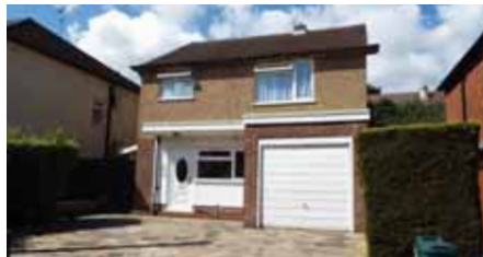
CATERHAM 01883 349114

This three bedroom detached property is located in a popular residential road. The property has been well maintained by the current owner and is both centrally heated and double-glazed. To the ground floor we have a lounge in excess of 23ft x 18ft, kitchen and cloakroom. To the first floor are three double bedrooms and a family bathroom. The rear garden is fully enclosed with a patio adjoining the house and raised lawn.