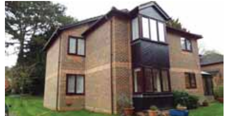
CATERHAM 01883 349114