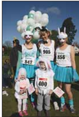
Last year this group of bunnies ran to raise awareness of Progressive Supranuclear Palsy (PSP).