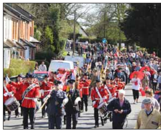
The parade marches down Godstone Road towards The Square.