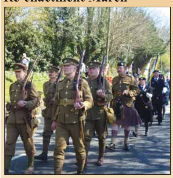
10th Essex Rgt., representing a Kitchener Battalion of 1914.