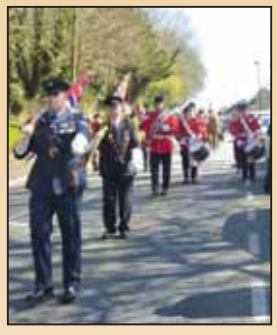
Standard bearers lead the parade.