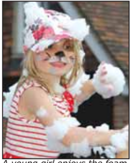
A young girl enjoys the foam fun at last year's street party.

The following weekend sees the Street Party in the High Street on Sunday 31st May, featuring four music areas, Sheridan the sheep dog, the Morris Rooster Rampant Dancers and Rico the Clown amongst the many attractions. There will also be plenty of stalls including a Pimms tent and food stalls. The event will end with the popular 'foam